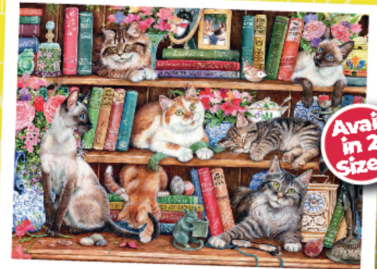
G3560 / G6404 - Puss Back in Books 500XL / 1000 pc £16