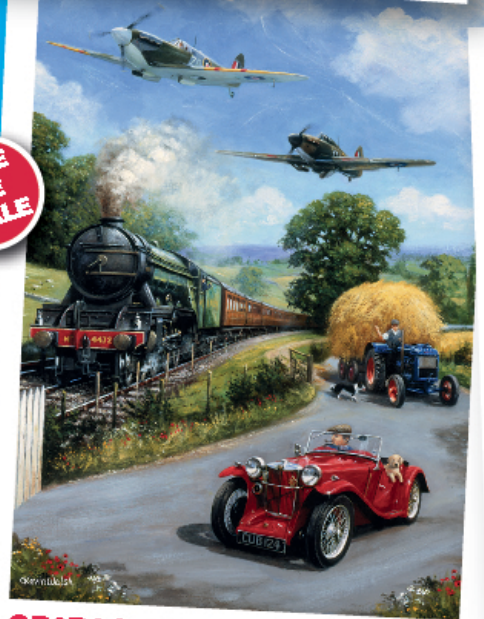
O74744 - Nostalgic Transport 1000pc £11