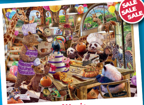
SC59663 - Chef Mania 1000pc £11