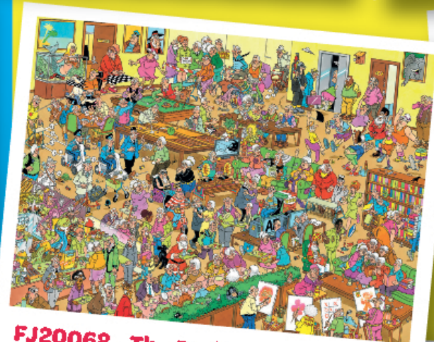
FJ20068 - The Retirement Home by JvH - 1500pc £18