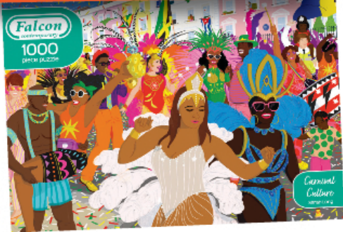
FJ11384 - Carnival Culture 1000pc £11