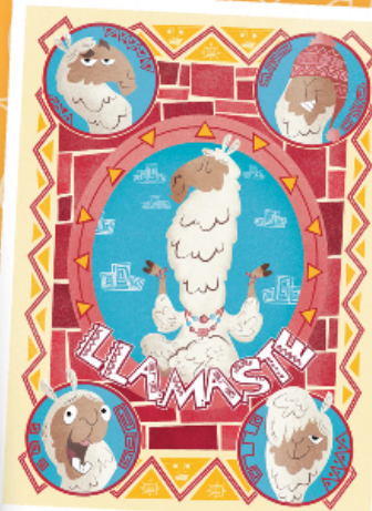
C35069 - Fantastic Llama 500pc £8