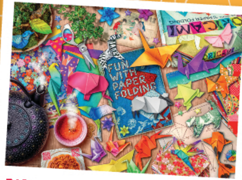
R16775 - Origame Mediations 1000pc £11