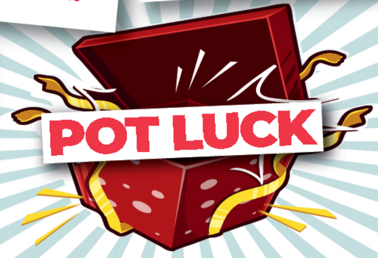
Pot Luck Puzzle (Undamaged Box) 500pc - £6, 1000pc - £9