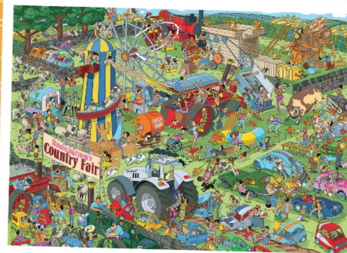
G7142 - Jokesaws - Country Show Chaos, 1000pc £15