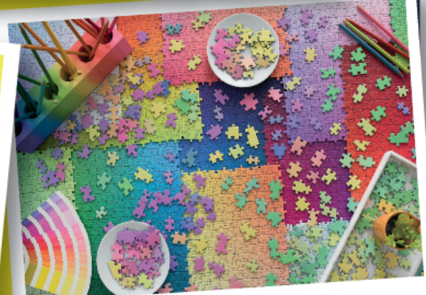
R17471 - Puzzles on Puzzles 3000pc £30