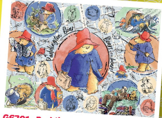
G6701 - Paddington 1000pc £16