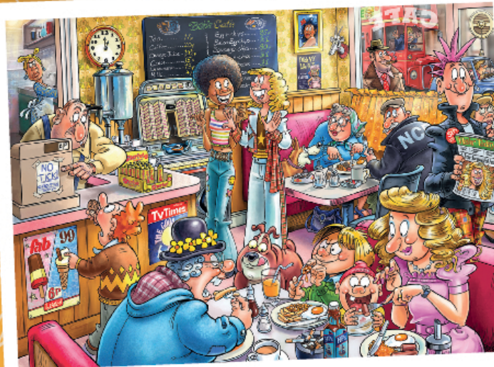
FJ100332 - WASGIJ Destiny 27 - Café to Latte, 1000pc £15

The Puzzle Club Ltd, 30 Adelaide Road, Bramhall, Stockport SK7 1LT Telephone: 0161 998 3708 Email: puzzle-club@btconnect.com www.jigsaw-puzzle-club.co.uk