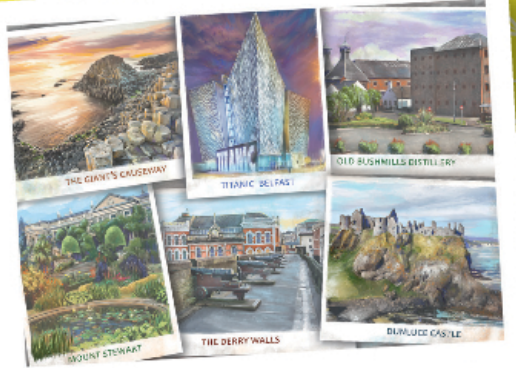
FJ500239 - Visit Northern Ireland 1000pc £15