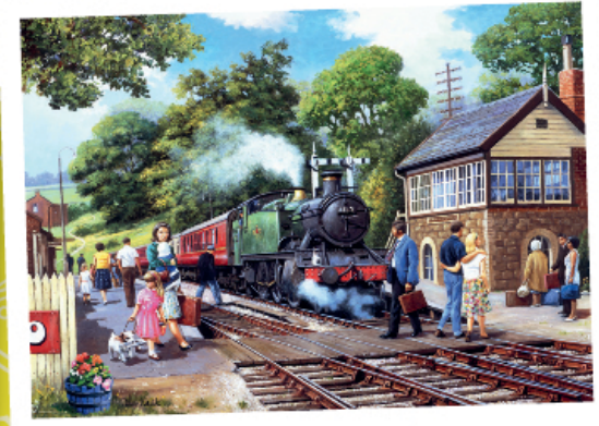
R17640 - A Country Station 1000pc £15