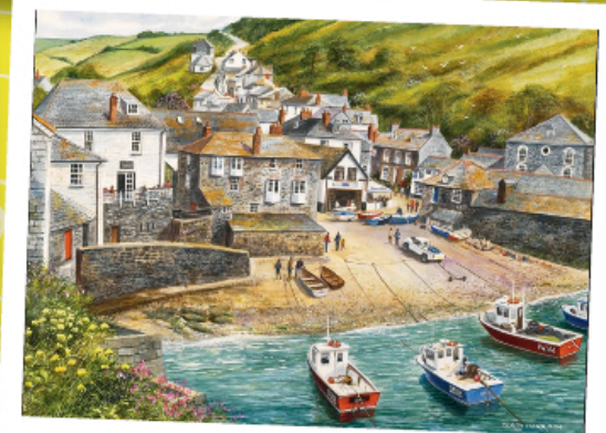
G892 - Port Isaac 500pc £11