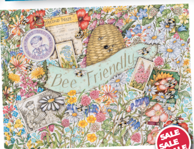
R17619 - Bee Friendly 1000pc £11