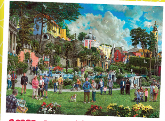
G6367 - Portmeirion 1000pc £15