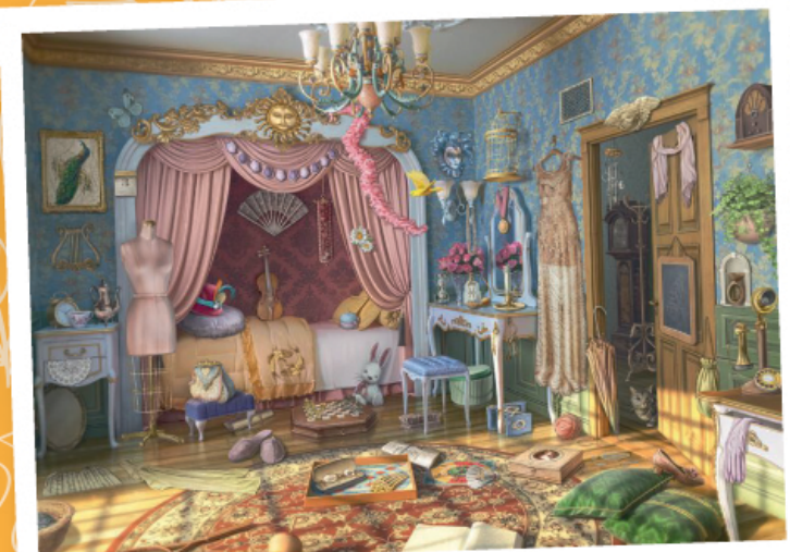
SC59976 - June's Journey - June's Bedroom, 1000pc £15

Please note we will be unavailable Thurs 4th - Sun 7th April