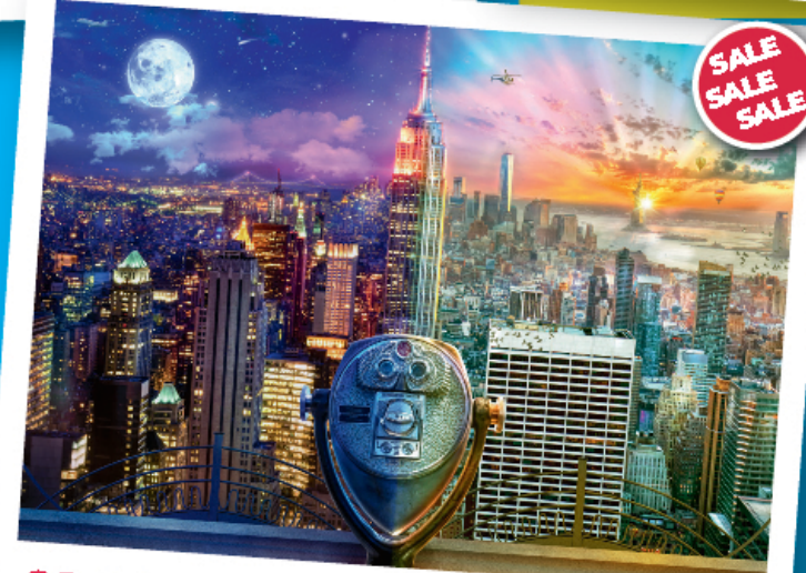
SC59905 - New York - Night & Day 1000pc £11