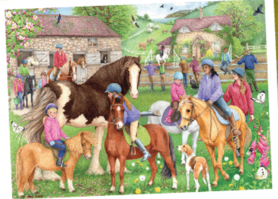
FJ500236 - Riding School 1000pc £15