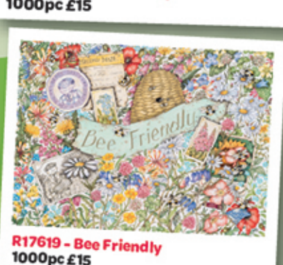
R17619 - Bee Friendly 1000pc £15