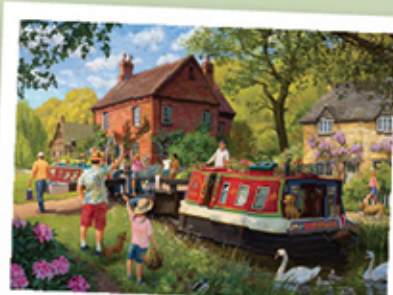
FJ500240 - Countryside Locks 1000pc £15