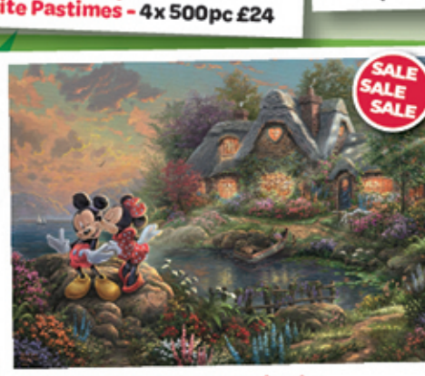
SC88370 - Mickey & Minnie in Sweetheart Cove - 1000pc £11