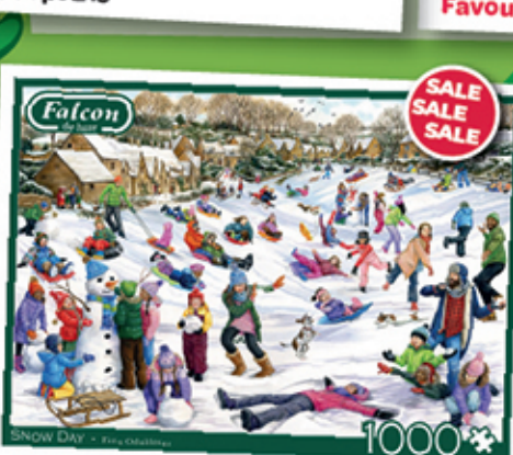
FJ11398 - Snow Day 1000pc £11