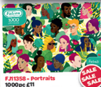
FJ11358 - Portraits 1000pc £11