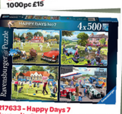
R17633 - Happy Days 7 Favourite Pastimes - 4x 500pc £24