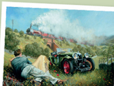
G3155 - Countryside Love 500pc £11