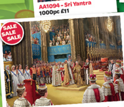
FJ100080 - The King's Coronation 1000pc £11