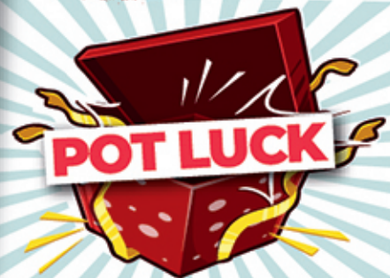
Pot Luck Puzzle (Undamaged Box) 500pc - £6, 1000pc - £9