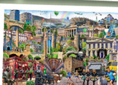
G6391 - Dublin Calling 1000pc £15