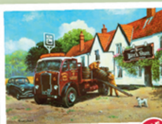
JHG10205 - Local Deliveries 1000pc £11

To order any of these specials and / or any of the other products featured in this issue complete the order form below and send with your remittance payable to: The Puzzle Club Ltd. For all unlisted items, please use remaining lines in price list or add a note to your order. (If you don't want to spoil your newsletter, simply put your request on paper) Please make cheques payable to: The Puzzle Club Ltd and send to The Puzzle Club Ltd - 30 Adelaide Road, Bramhall, Stockport SK7 1LT - For all unlisted items, please add a note in with your order.