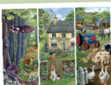
FJ500242 - Woodland Farm 1000pc £15