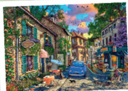
G6385 - Morning in the Med 1000pc £15