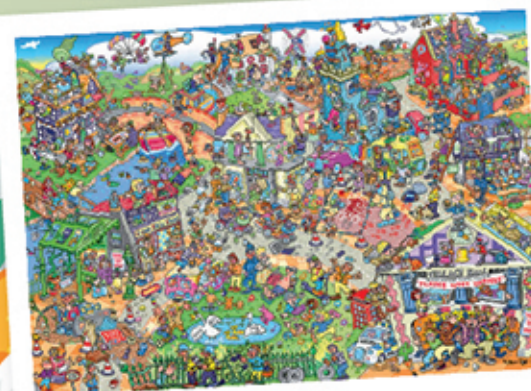
G7141 - Jokesaws - Midsummer Mayhem, 1000pc £15