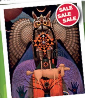
AA1094 - Sri Yantra 1000pc £11