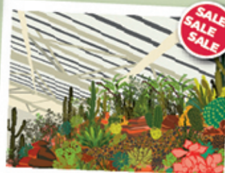
G3603 - Brutalist Conservatory 500pc £8