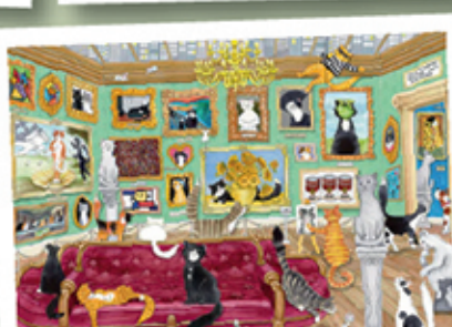
G6402 - Night at the Meowseum 1000pc £15