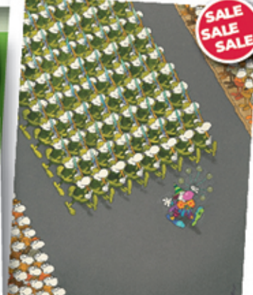
C35078 - Mordillo - The March 500pc £8