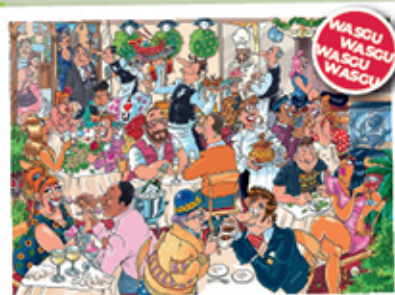
FJ100331 - WASGIJ - Mystery 26 Date Night - 1000pc £15