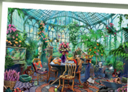
R14832 - Greenhouse Morning 500pc £11