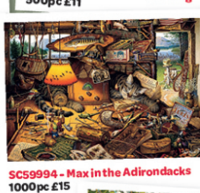
SC59994 - Max in the Adirondacks 1000pc £15