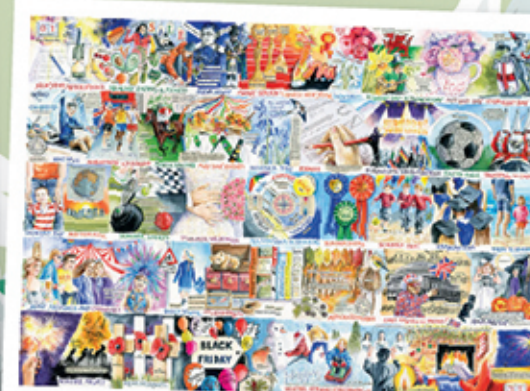
G7140 - A Year in Great Britain, 1000pc £15