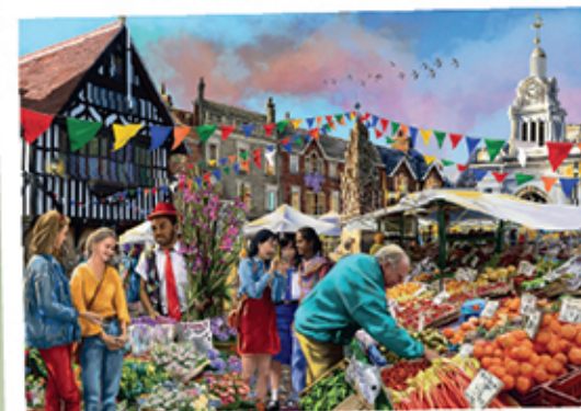
FJ500241 - Saffron Walden Market, 1000pc £15