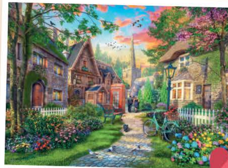
R17628 - Down the Lane No.4 Church Lane - 1000pc £15