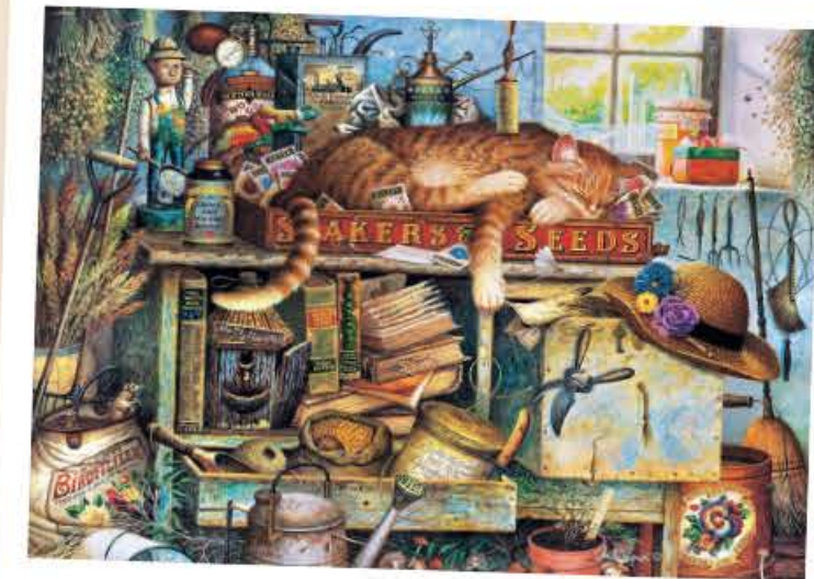
SC59992 - Remington the Horticulturist 1000pc £15