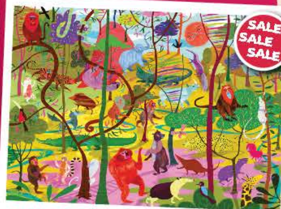
FJ11356 - The Wild , 1000pc £11