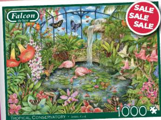
FJ11295 - Tropical Conservatory , 1000pc £11