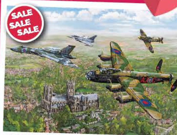
G3552 - Changing of the Guard , 500XL £11