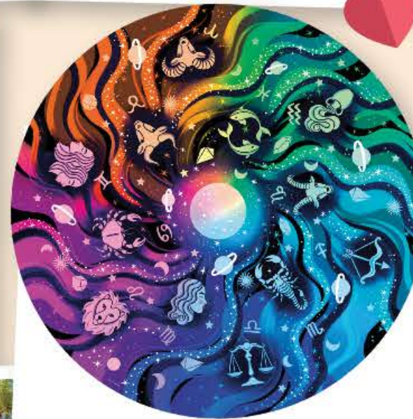
R00819 - Astrology (Circular) , 500pc £12