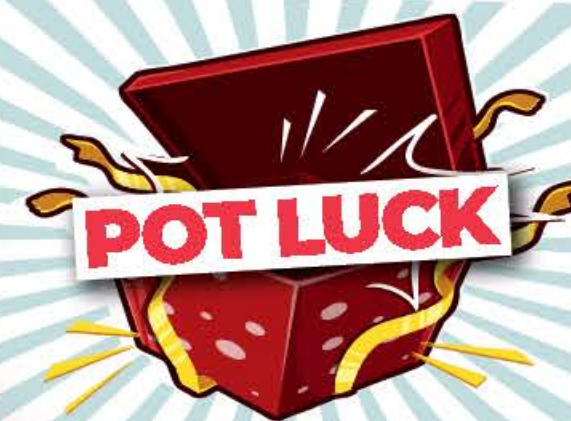
Pot Luck Puzzle (Undamaged Box) 500pc - £6, 1000pc - £9

Please send your entries to us by end February 2024 and let us know which jigsaw (up to 1000pc) you would like if your entry is selected as the winner.