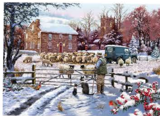
O76765 - Home Farm , 1000pc £15