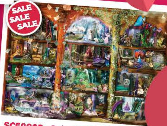
SC58965 - Fairytale Magic , 1000pc £11