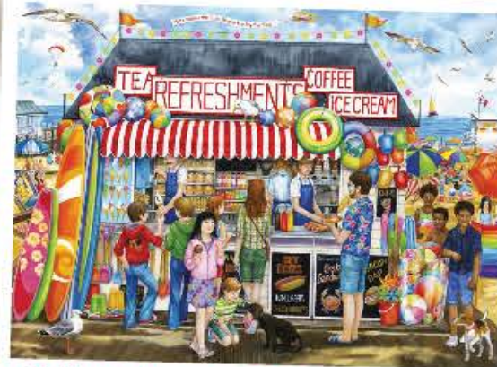
O76732 - Summer Time , 1000pc £15