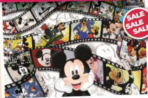
Disney - Mickey Mouse 90th 1000pc £11