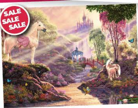
R15035 - Magical River , 500pc £8