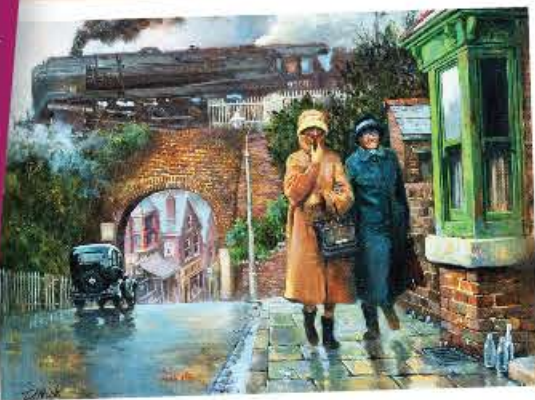
G6374 - Nearly Home 1000pc £15