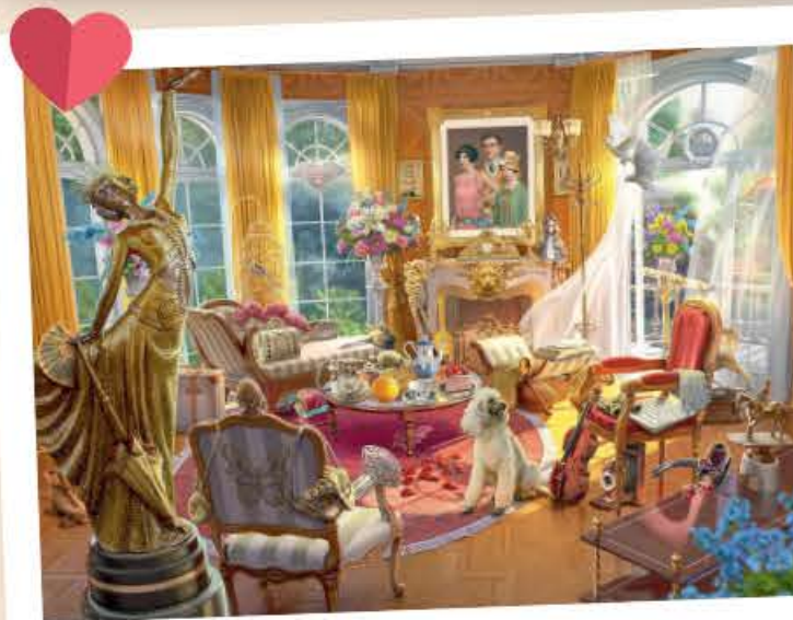
SC59975 - June's Journey Orchid Estate Parlour - 1000pc £15

The Puzzle Club Ltd, 30 Adelaide Road, Bramhall, Stockport SK7 1LT Telephone: 0161 998 3708 Email: puzzle-club@btconnect.com www.jigsaw-puzzle-club.co.uk