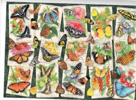
R17624 - Tropical Butterflies , 1000pc £15