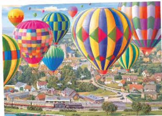
O76744 - Balloon Flight , 500 XL £15