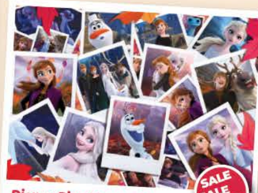
Disney Pix - Frozen 2 1000pc £11