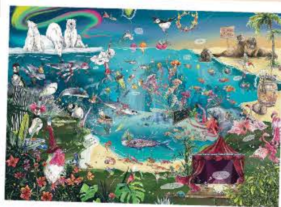
G7131 - A Collective of Creatures , 1000pc £17