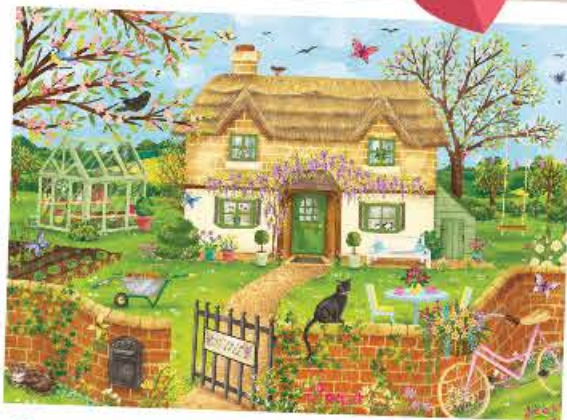
O76735 - Wisteria Cottage , 1000pc £15