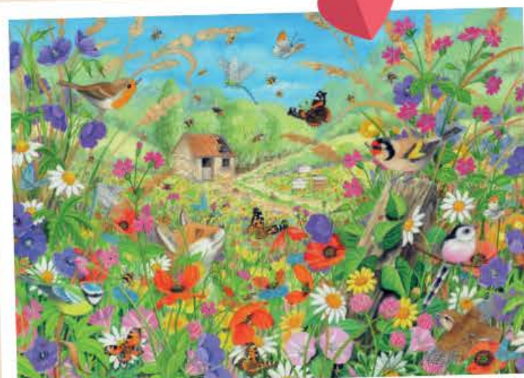
O76742 - Wildlife Meadow (British Bee Charity) - 1000pc £15