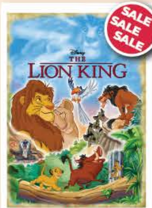
Disney - Lion King 1000pc £11