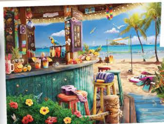
R17463 - Beach Bar Breezes , 1500pc £22