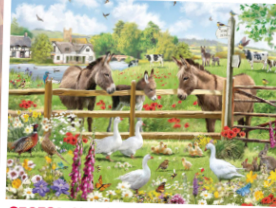
O76729 Meadow View 500pcs - £11.00