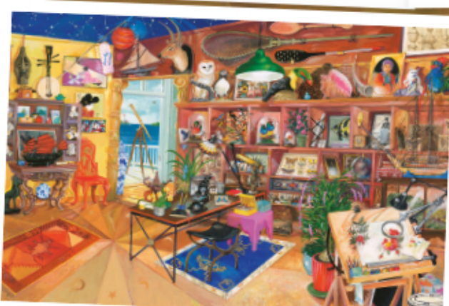
R17465 The Curious Collection 3000pcs - £35.00