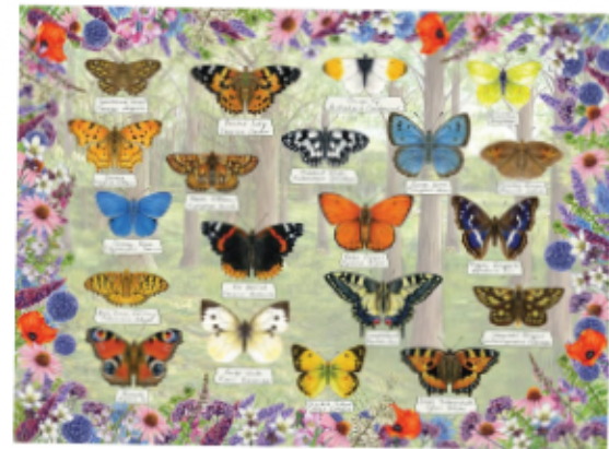
G6366 Beautiful Butterflies 1000pcs - £15.00