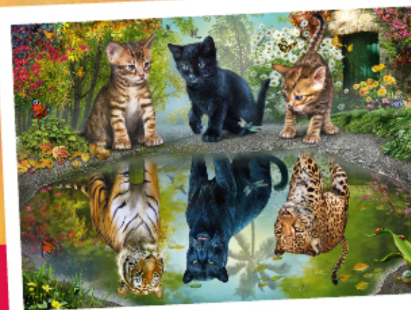
SC57392 - Dream Big! 1000pcs - £15.00