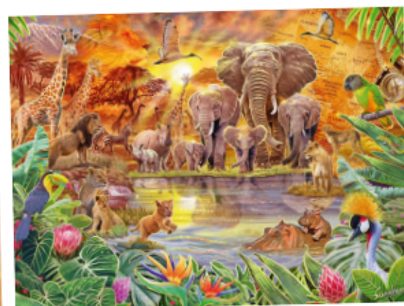
SC59982 African Kingdom (Steve Sundram) 1000pcs - £15.00