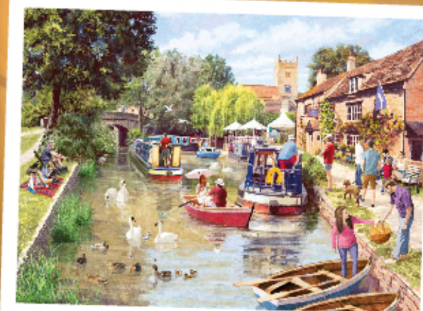
D76743 - Canal Walk 1000pcs - £15.00