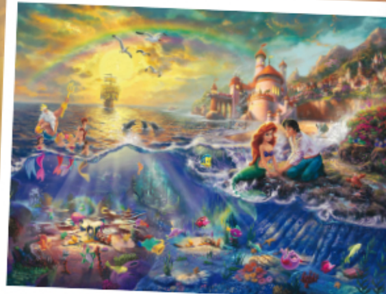
SC88361 Disney Little Mermaid (Thomas Kinkade) 1000pcs - £15.00