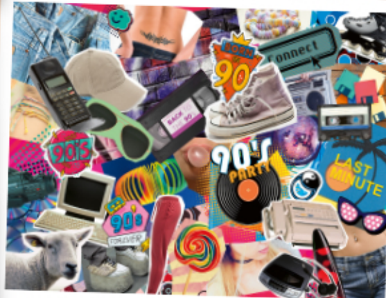
R17388 The 90s 1000pcs - £15.00