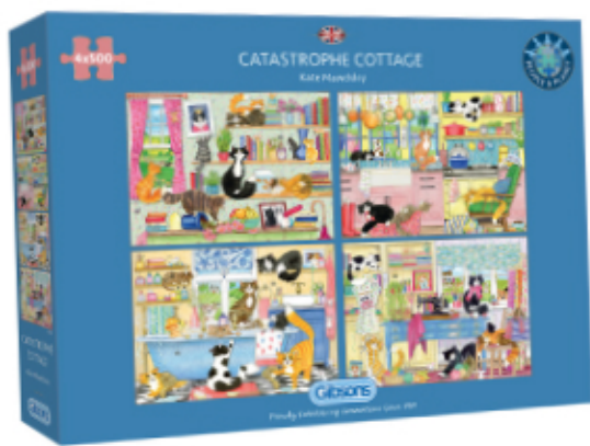
G5062 Catastrophe Cottage 4 x 500pcs - £25.00