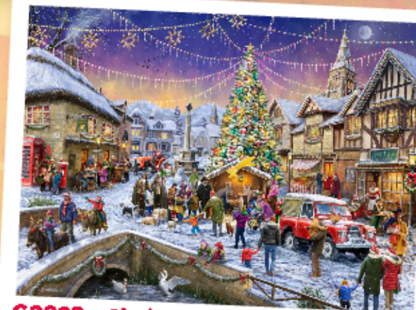
G2023 - Christmas Spirit (Limited Edition) 1000pcs - £18.00