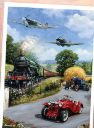
D74744 Nostalgic Transport 1000pcs - £7.00