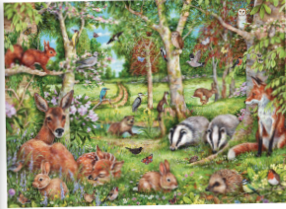
O76728 Woodland Adventures 500pcs - £11.00