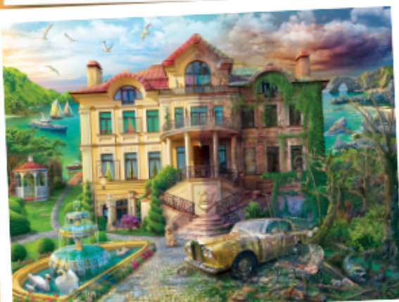
R17464 Cove Manor Echoes 2000pcs - £25.00