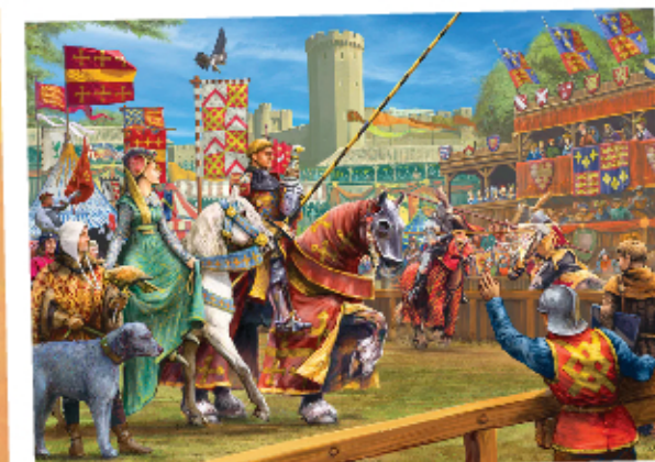
G6369 - The Joust at Warwick 1000pcs - £15.00