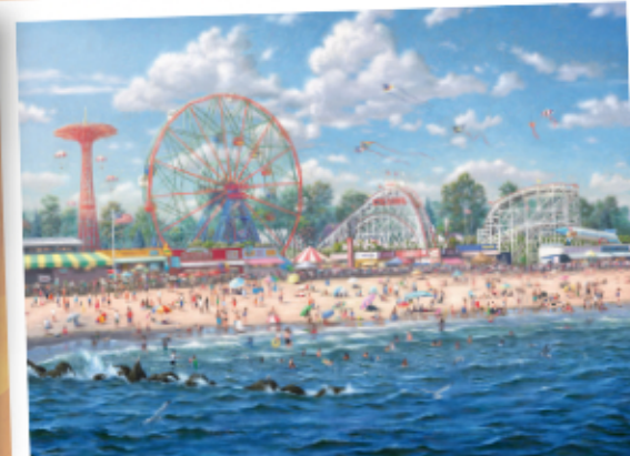
SC57365 Coney Island (Thomas Kinkade) 1000pcs - £15.00