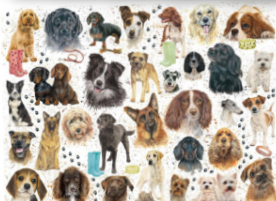
O76741 Dog Montage 1000pcs - £15.00