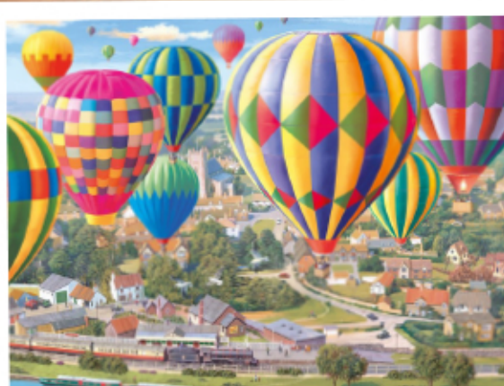
O76744 Balloon Flight 500 XL pcs - £15.00