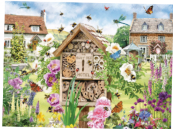
O76731 Busy Bee Hotel 500pcs - £11.00