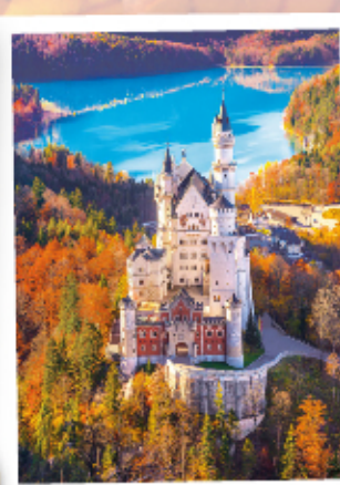
C39382 Neuschwanstein Castle 1000pcs - £11.00