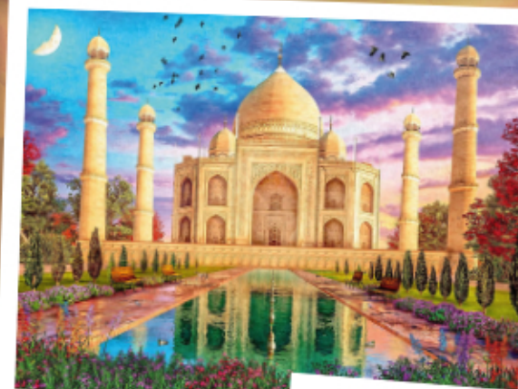
R17438 Taj Mahal 1500pcs - £20.00