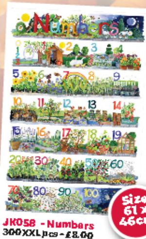
JK058 - Numbers 300XXL pcs - £8.00

SALE Puzzles LIMITED STOCK SALE Puzzles LIMITED STOCK SALE Puzzles LIMITED STOCK SALE Puzzles LIMITED STOCK SALE Puzzles LIMITED STOCK SALE Puzzles LIMITED STOCK