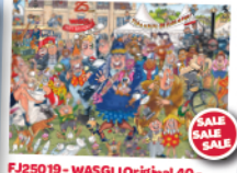
FJ25019 - WASGLJ Original 40 - 25th Anniversary Garden Party 2x 1000pcs - £11.00

To order any of these specials and / or any of the other products featured in this issue complete the order form below and send with your remittance payable to The Puzzle Club Ltd. For all unlisted items, please use remaining list prices if not in stock or add no to your order. (If you don't want to spoil your newsletter, simply put in your request only). Please make cheques payable to The Puzzle Club Ltd and send to The Puzzle Club Ltd - 30 Adelaide Road, Bramhall, Stockport SK7 1LT - For all unlisted items, please add an extra 10% to your order.