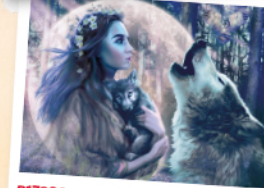
R17390 - Moonlight Magic 1000pcs - £15.00