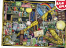
R17486 - Grandad's Locker 1000pcs - £11.00