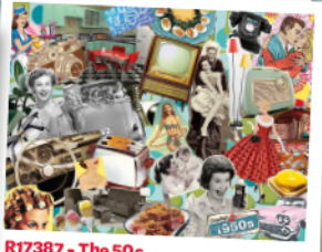
R17387 - The 50s 1000pcs - £15.00