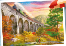
G6365 - Crossing Glenfinnan Viaduct 1000pcs - £15.00