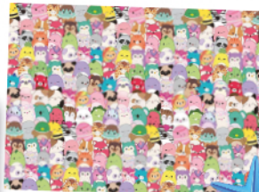
R17553 - Squishmallows 1000pcs - £15.00