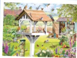
O76374 - Garden Friends 500XL pcs - £15.00