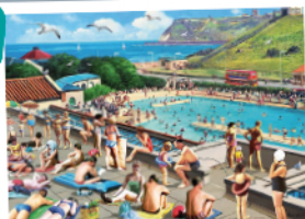
R17548 - Leisure Days No.8 Scarborough 1000pcs - £15.00