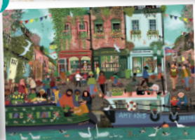
R17554 - Riverside Town 1000pcs - £15.00