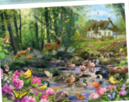
G6370 - Woodland Glade 1000pcs - £15.00