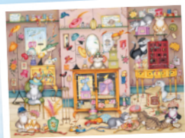
G3149 - Hetty's Hats 500pcs - £10.00