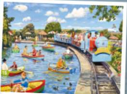
G6361 - Boating Lake 1000pcs - £15.00