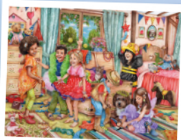
G3150 - Fancy Dress Fun 500pcs - £10.00