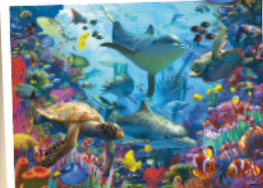
R17550 - Coral Reef Retreat 1000pcs - £15.00