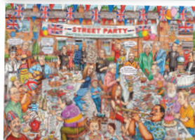
R17549 - Best of British No.24 Street Party - 1000pcs - £15.00