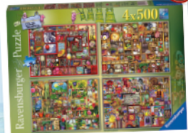
R17558 - Wonderful World of Colin Thompson 4 x 500 pcs - £26.00