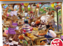
SC59963 - Chef Mania 1000pcs - £11.00