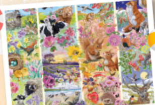
G6349 - Through the Seasons 1000pcs - £15.00 (also available in 500XL pc, £15)