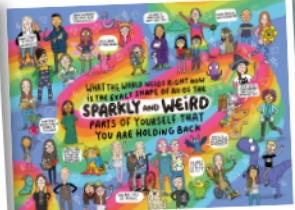
G6618 - Every Piece of You 1000pcs - £15.00