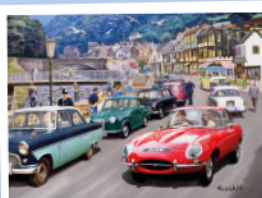
G3151 - Lynmouth Living 500pcs - £10.00