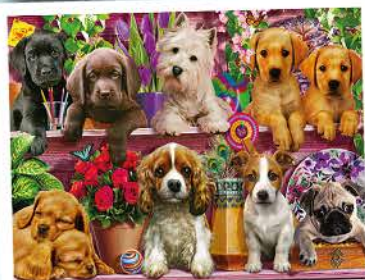
SC58973 - Dog in the Shelves 500pcs - £11.00