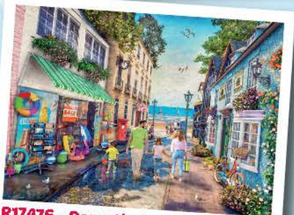
R17476 - Down the Lane No.3 - Seaview Lane 1000pcs - £15.00