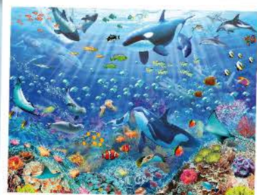
R17444 - Colourful Underwater World 3000pcs - £35.00