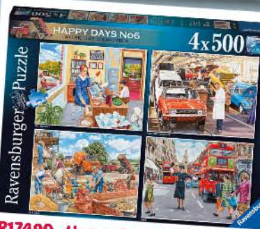
R17490 - Happy Days No 6, Work Day Memories - 4x500pcs - £26