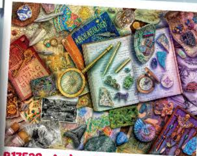
R17520 - Archaeology 500pcs - £11.00