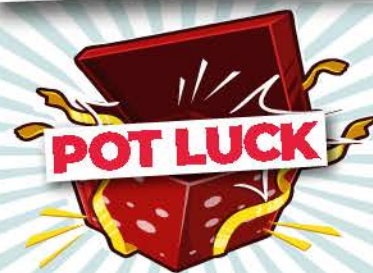
Pot Luck Puzzle (Undamaged Box) 500pc - £6, 1000pc - £9 1500pc - £12