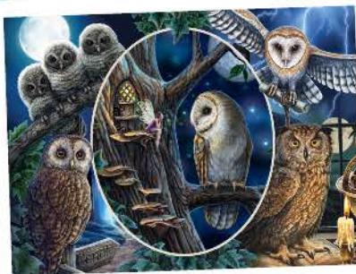
SC59667 - Mysterious Owls 1000pcs - £15.00