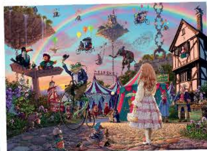
R17482 Look & Find No.2, Enchanted Circus - 1000pcs - £15.00