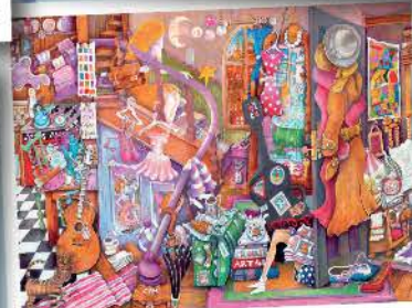
R17483 - Student Days 500pcs - £11.00