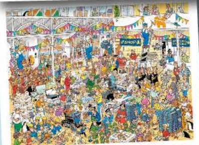
FJ100020 - 10 Years JvH Studio Surprise 1000pcs - £15.00