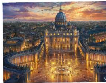
SC59628 - The Vatican 1000pcs - £15.00