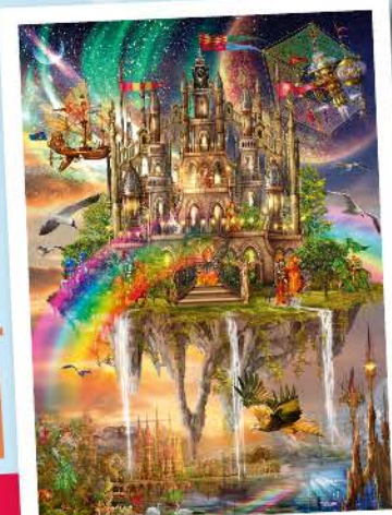
SC58979 - City in the Sky 1000pcs - £15.00