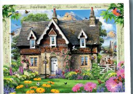
R17489 - Country Cottage No.15 - Hillside Cottage 1000pcs - £15.00