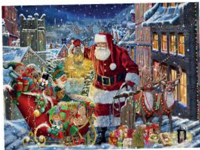
FJ500131 - Christmas Eve 2 x 1000pcs - £15.00