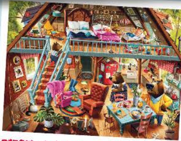
R17311 - Goldilocks Gets Caught! 1000pcs - £15.00