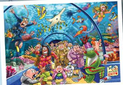
FJ100028 - WASGIJ Original 43 - Aquarium Antics 1000pcs - £15.00