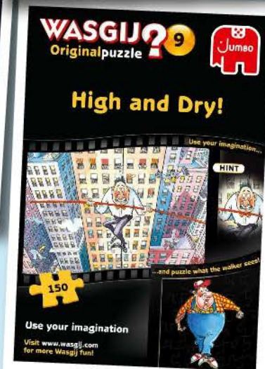
FJ81782 WASGIJ Original 9 (150pc) - High & Dry 150pcs - £5.00