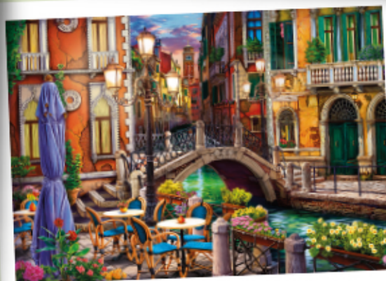
R17320 - Venice Twilight 750 XL pcs - £15.00