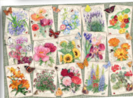
R17485 - Country Garden Favourites 1000pcs - £15.00