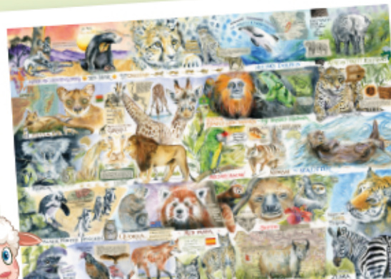
G7134 - Sun Bears & Sloths 1000pcs - £15.00