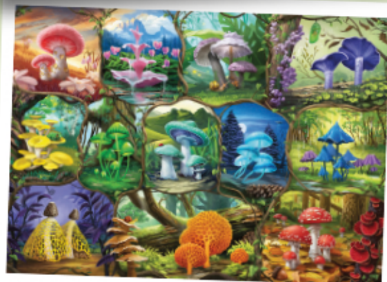
R17312 - Beautiful Mushrooms 1000pcs - £15.00