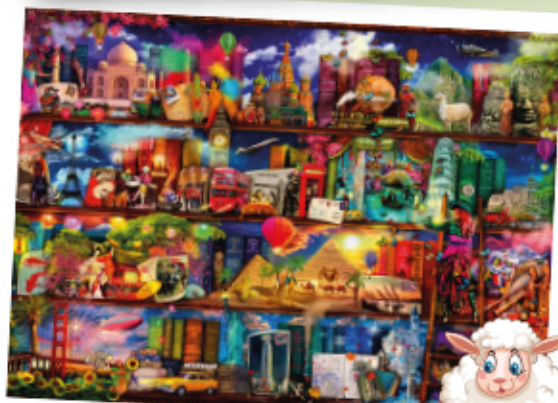
R16685 - World of Books 2000pcs - £22.00