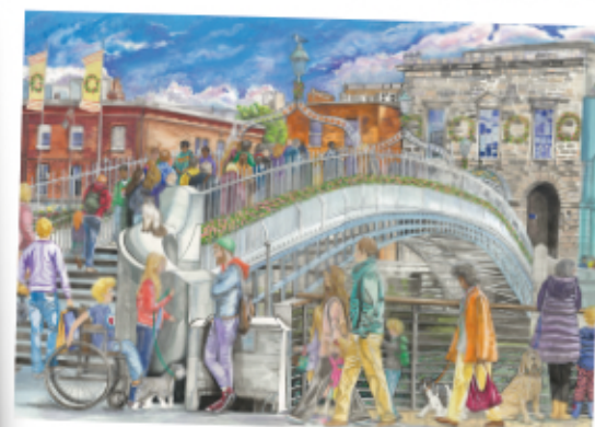
G6350 - Ha'penny Bridge 1000pcs - £15.00