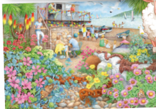
R17479 - Cosy Café No.1, Beach Garden Café 1000pcs - £15.00