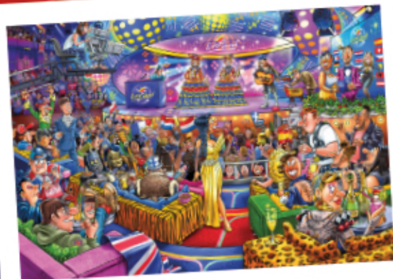
FJ100019 - Wasgij Mystery 25 Eurosound Contest 1000pcs - £15.00