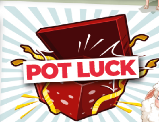
Pot Luck Puzzle (Undamaged Box) 500pc - £6, 1000pc - £9