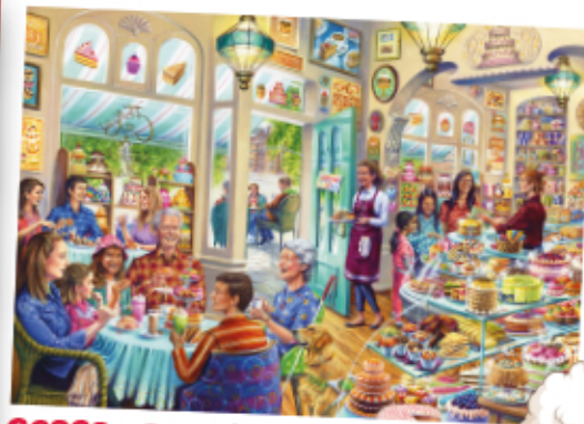
G6363 - Grandma's Treat 1000pcs - £15.00