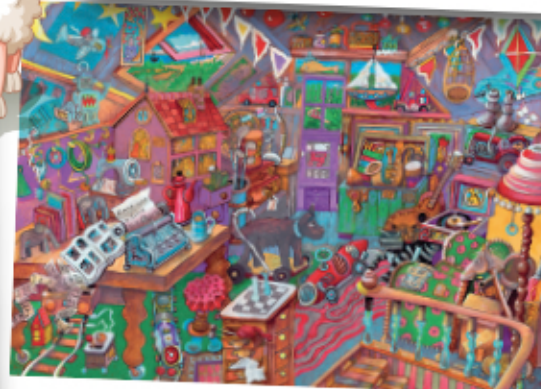
R17480 - Grandparents' Hideaway 1000pcs - £15.00