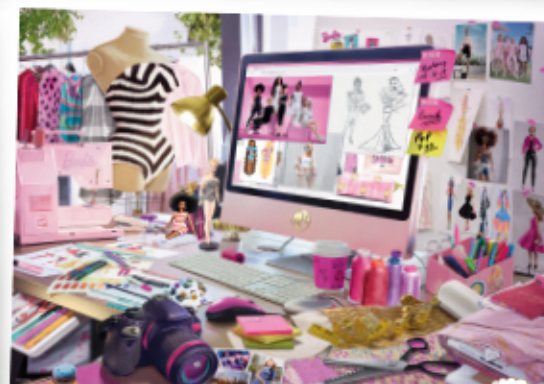
R17518 - Barbie Fashion Icon 1000pcs - £15.00