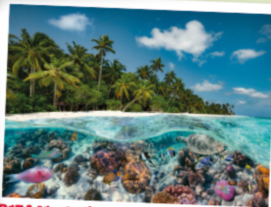
R17441 - A Dive in the Maldives 2000pcs - £22.00