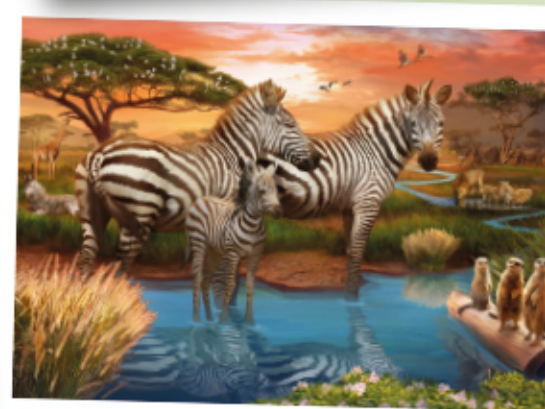
R17376 - Zebras at the Waterhole 500pcs - £10.00