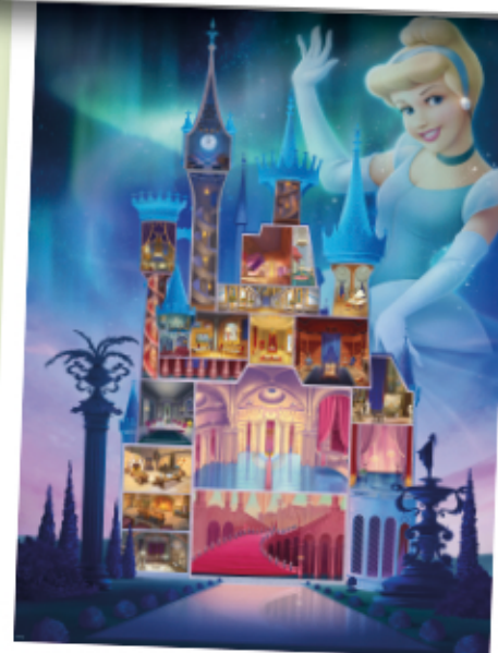
R17331 - Disney Castles: Cinderella 1000pcs - £15.00