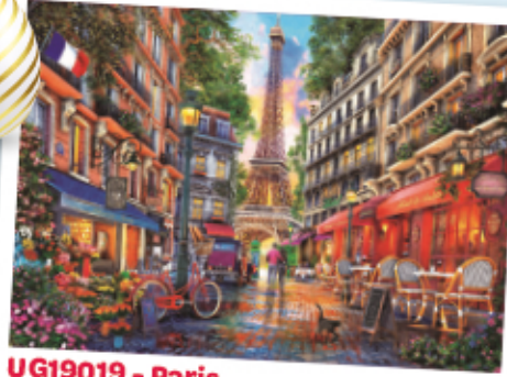
UGI9019 - Paris 1000pcs - £15.00

To order any of these specials and / or any of the other products featured in this issue complete the order form below and send with your remittance payable to: The Puzzle Club Ltd. For all unlisted items, please use remaining lines in price list or add a note to your order. (If you don't want to spoil your newsletter, simply put your request on paper) Please make cheques payable to: The Puzzle Club Ltd and send to The Puzzle Club Ltd - 30 Adelaide Road, Bramhall, Stockport SK7 1LT - For all unlisted items, please add a note in with your order.