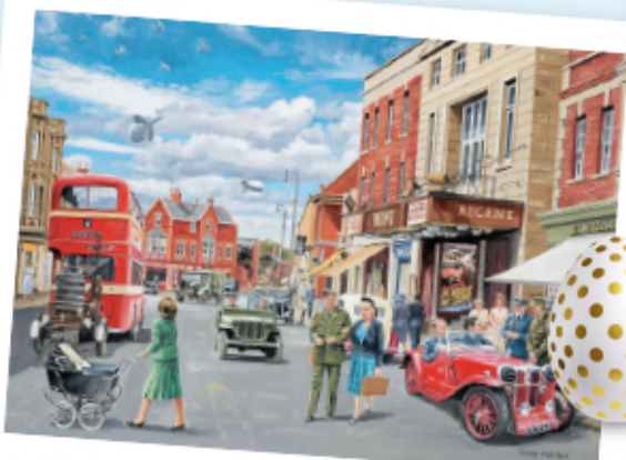
JHG50850 / JHG10881 - 1940s High Street 500/1000pcs - £10 / £15