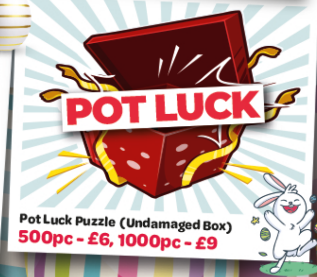
Pot Luck Puzzle (Undamaged Box) 500pc - £6, 1000pc - £9