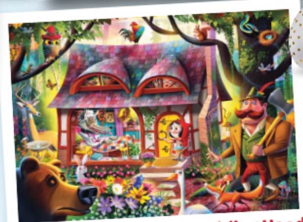
R17462 - Come in, Red Riding Hood 1000pcs - £15.00