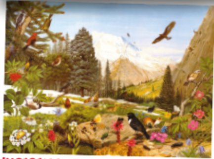
JHG101136 - European Collection - Mountains No.5 1000pcs - £15.00