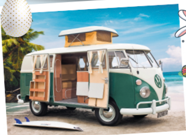
R17087 - Volkswagen T1 Camper Van 1000pcs - £15.00