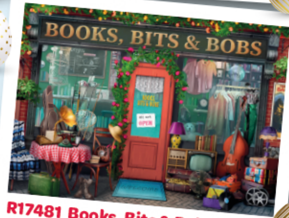
R17481 Books, Bits & Bobs 1000pcs - £15.00