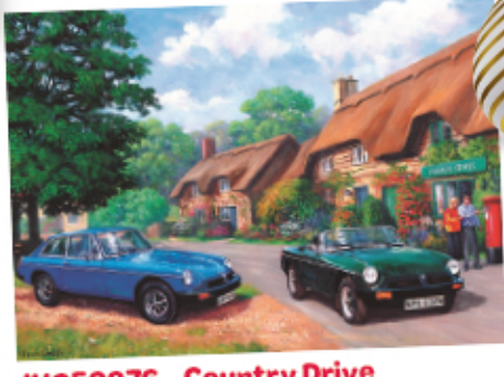
JHG50876 - Country Drive 500pcs - £9.00