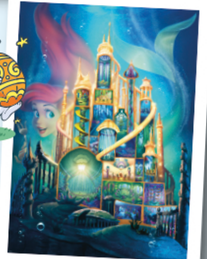
R17337 - Disney Ariel Castle 1000pcs - £15.00