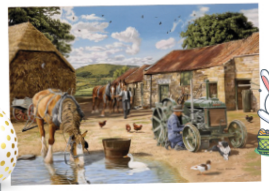
JHG50852 / JHG10882 - Back from the Fields 500/1000pcs - £10 / £15