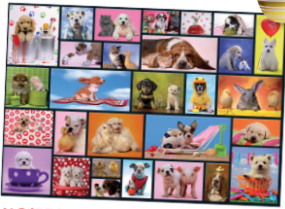
UG15518 - Shared Moments 1000pcs - £15.00