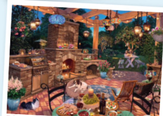
R17477 - My Haven No.10, The Garden Kitchen 1000pcs - £15.00