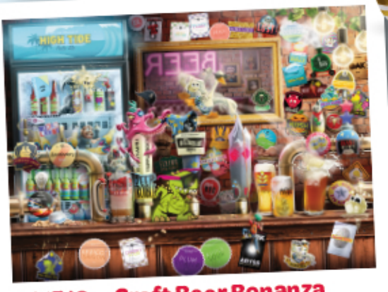
R17510 - Craft Beer Bonanza 1500pcs - £17.00