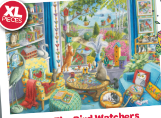
R17328 - The Bird Watchers 750XL pcs - £15.00