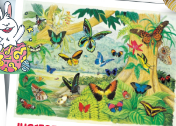
JHG15056 - Flying Rainbows 2 1500pcs - £16.00