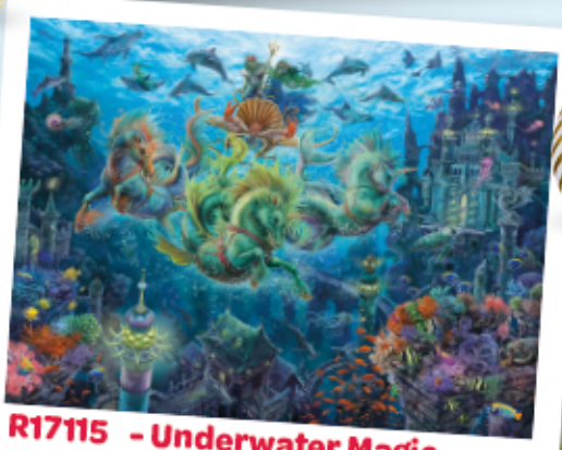
R17115 - Underwater Magic 2000pcs - £20.00