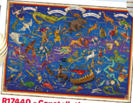
R17440 - Constellations 2000pcs - £20.00