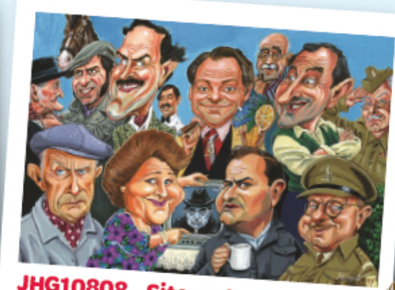
JHG10808 - Sitcom Legends 1000pcs - £15.00