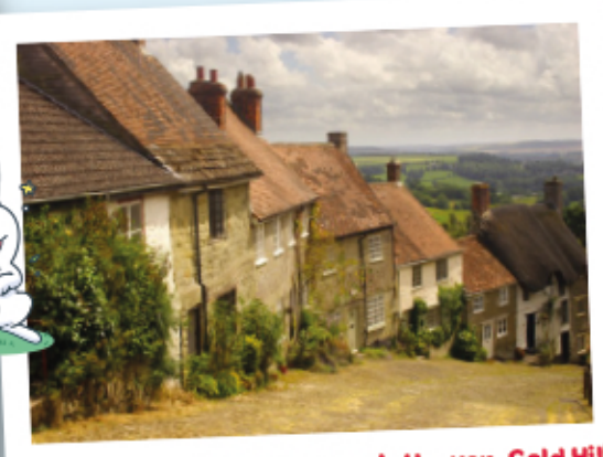
JHG50936 / JHG10093 - Hovis Heaven, Gold Hill 500/1000pcs - £10 / £15