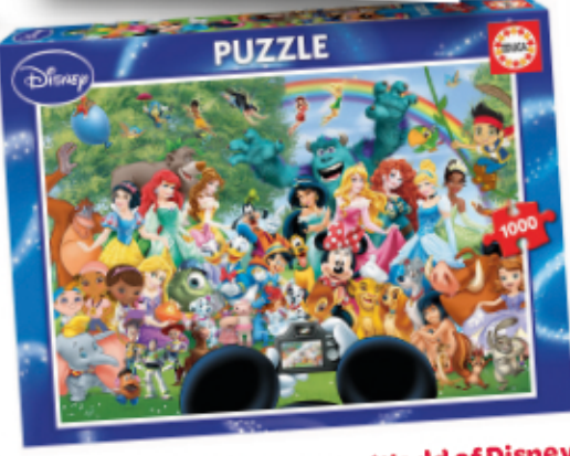
UG16297 - The Marvellous World of Disney 1000pcs - £15.00