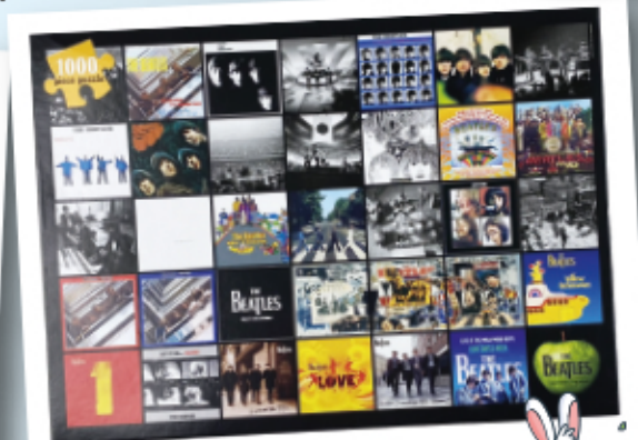
UG08409 - The Beatles Album Montage 1000pcs - £15.00