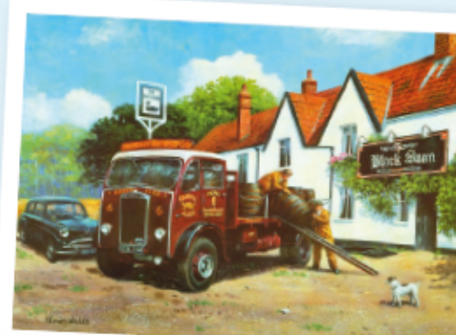
JHG10205 - Local Deliveries 1000pcs - £15.00