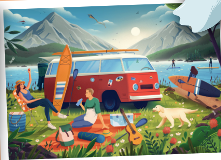
FJ11387 - Van Life 1000pcs - £14.00

To order any of these specials and / or any of the other products featured in this issue complete the order form below and send with your remittance payable to: The Puzzle Club Ltd. For all unlisted items, please use remaining lines in price list or add a note to your order. (If you don't want to spoil your newsletter, simply put your request on paper) Please make cheques payable to: The Puzzle Club Ltd and send to The Puzzle Club Ltd - 30 Adelaide Road, Bramhall, Stockport SK7 1LT - For all unlisted items, please add a note in with your order.