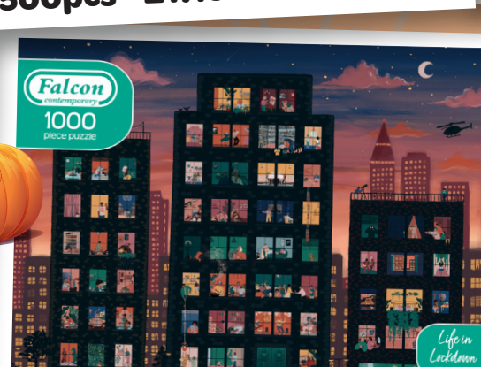
FJ11357 - Life in Lockdown 1000pcs - £11.00