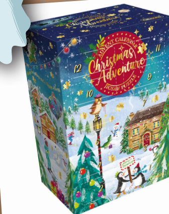
G9510 - Christmas Adventures Advent Calendar 24x80pcs - £30.00

Winner of 'Gift of the Year' and featured on 'ITV's This Morning', why not start your Christmas countdown with our brand-new advent calendar illustrated by Claire McElfrick! With 24 doors, you can unbox a Christmassy scene 80pc puzzle surprise every single day. Packaged in a striking box with gold foiling, this gorgeous calendar is the perfect gift for any puzzle fan and includes puzzle glue and ribbon, so you can craft your own Christmas decorations when you have completed a jigsaw. The puzzles come in six different shapes, making every puzzle a mini challenge.