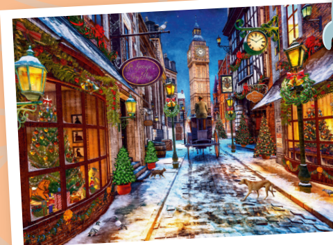
R17086 - Christmastime 1000pcs - £15.00

It's almost Christmas Eve, and the elves present Santa with a cake to celebrate reaching another production deadline! All around them the workshop is packed with colourful gifts; the last few are being finished, and soon the mammoth task of wrapping will start. Through the workshop door, snow is falling, the sleigh awaits and the reindeer are ready to play their part. This superb hand-illustrated puzzle is packed with wonderful details and lavish colours; we love the unique "year" clock (counts the year in months, not hours), the crowded shelves, beautiful decorations, machinery, tools and the magnificent structure of the timber-framed workshop.