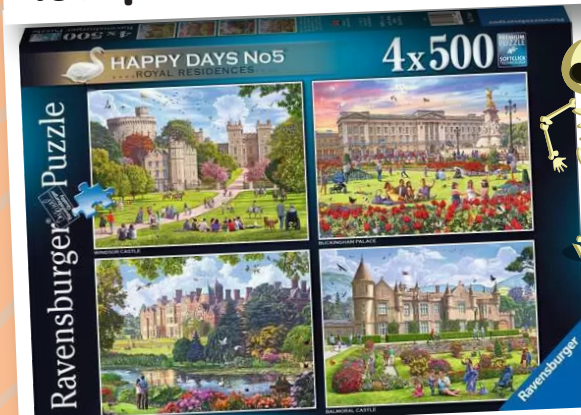
R17140 Happy Days No 5 Royal Residences 4x500pcs - £23.00