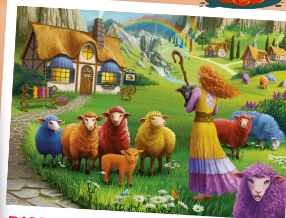
R16949 - The Happy Sheep Yarn Shop 1000pcs - £15.00