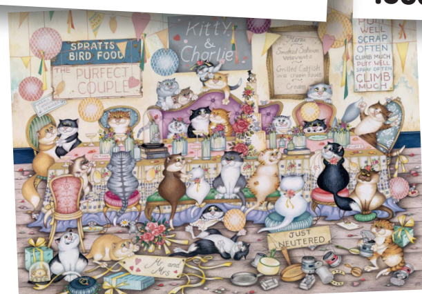
G6342 - Happy Ever After 1000pcs - £11.00