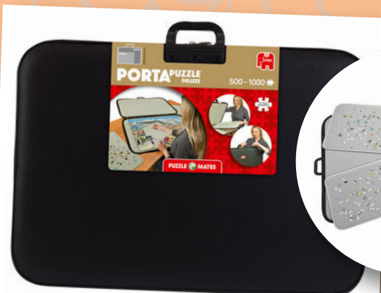
FJ01039 - Portapuzzle Deluxe 500-1000pc - £45.00