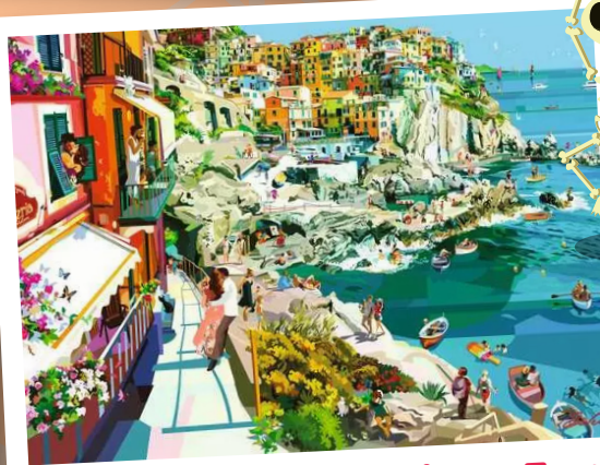
R16953 - Romance in Cinque Terre 1500pcs - £17.00