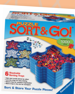
R17930 - Sort & Go Sorting Trays 1000pcs - £14.00