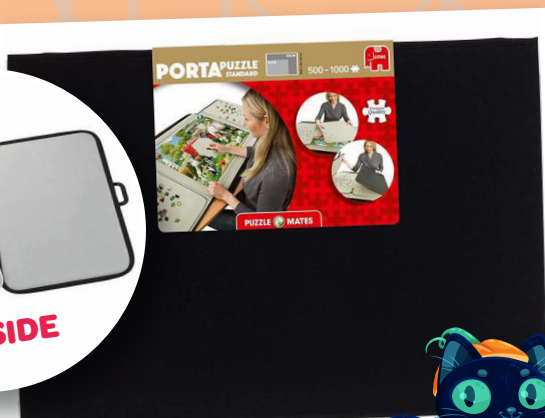
FJ10715 - Portapuzzle 500-1000pc - £30.00