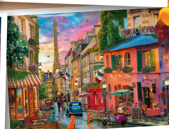
G6329 - Sunset Over Paris 1000pcs - £11.00