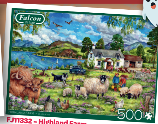
FJ1332 - Highland Farm 500pcs - £10.00

A beautiful illustration of life on a family farm in Scotland's stunning Highlands, illustrated by the ever-popular Debbie Cook.