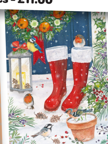
O75100 - The Doorstep 1000pcs - £11.00