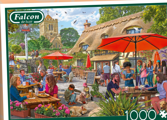
FJ11368 - The Pub Garden 1000pcs - £14.00