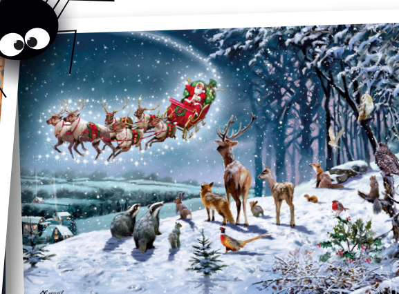
O74459 - Magical Christmas 500pcs - £8.00