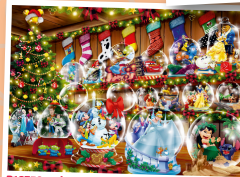
R16772 - Disney Christmas Snowglobe Paradise 1000pcs - £15.00

A beautiful illustration of life on a family farm in Scotland's stunning Highlands, illustrated by the ever-popular Debbie Cook.