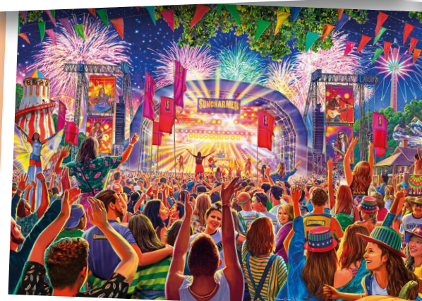
G6322 - Make Some Noise 1000pcs - £11.00