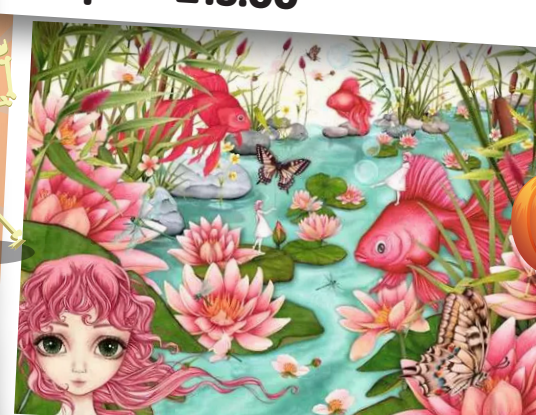
R16944 - Minu's Pond Daydreams 500pcs - £10.00