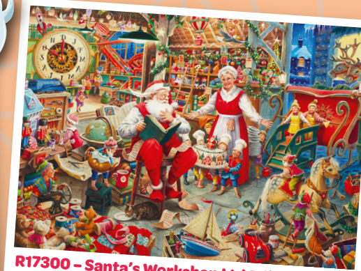
R17300 - Santa's Workshop Ltd Edition (26th) 1000pcs - £15.00

A peaceful view of a street in London at Christmas in years-gone-by as a coach and horses rattles along the snow-covered cobbles and a few still brightly-lit shops showing off their wonderful Christmas trees.