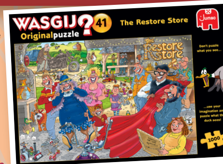
FJ25020 - WASGIJ Original 41 The Restore Store - 1000pcs - £15.00

This puzzle features the Wasgij family at The Restore Store where they have taken Grandad's old motorbike to be repaired. What will be revealed as they pull back the cover on the finished item? What has wowed everyone so much that even the horse has turned his head to get a look? Your job is to piece together the image that everyone is looking at.