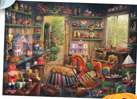
R17084 - Nostalgic Toys 1000pcs - £15.00