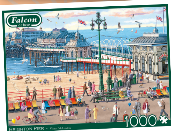
FJ11377 - Brighton Pier 1000pcs - £14.00