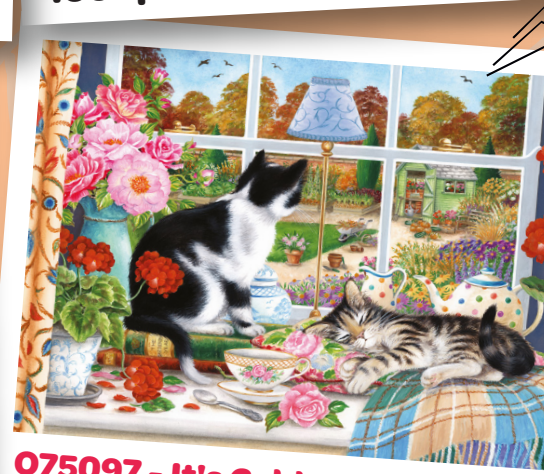
O75097 - It's Cold Outside 1000pcs - £11.00