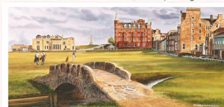
G4056 - St Andrews 636pc - £12.00

A stunning historic illustration by Kevin Walsh showing families and friends enjoying a glorious summers day at Sidmouth seafront. Do you recognise it?