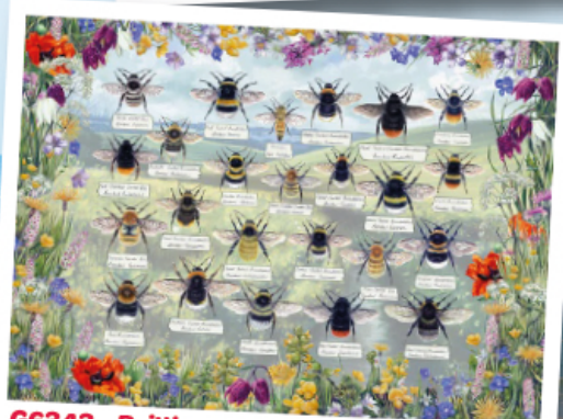
G6343 - Brilliant Bees 1000pcs - £15.00