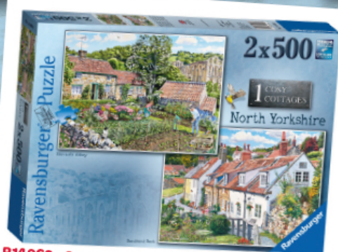
R14969 - Cosy Cottages 1 - North Yorkshire 2 x 500pcs - £14.00