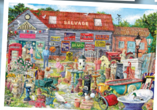
G8020 - Pots & Penny Farthings 2000pcs - £22.00