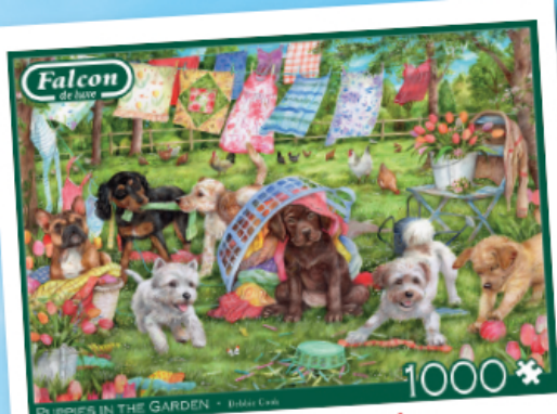
FJ11390 - Puppies in the Garden 1000pcs - £14.00