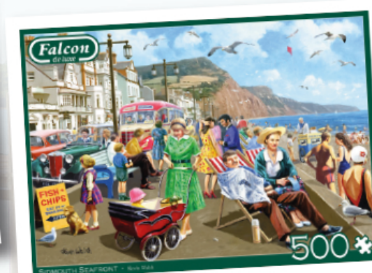
FJ11375 - Sidmouth Seafront 500pcs - £10.00

Illustrated by Steve Crisp, 'The Transport Museum' image features a stunning museum collection of iconic aeroplanes, classic automobiles and beloved buses and trams which has attracted visitors of all ages ready to take a closer look at these stunning vehicles.