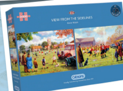
G5060 - View from the Sidelines 2 x 500pcs - £15.00