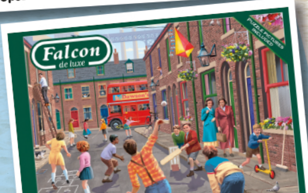
FJ11376 - Playing in the Street 2 x 500pcs - £14.00