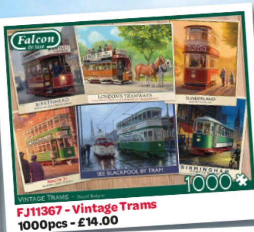
FJ11367 - Vintage Trams 1000pcs - £14.00