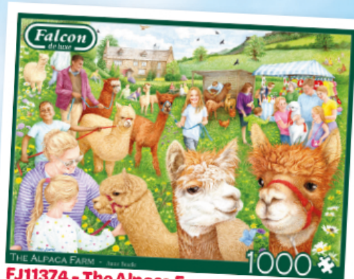
FJ11374 - The Alpaca Farm 1000pcs - £14.00