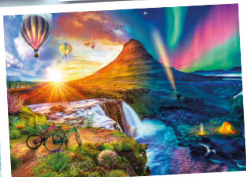
SC59908 - Island - Night & Day 1000pcs - £14.00