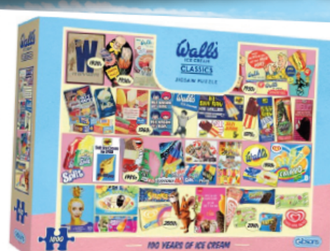
G7122 - 100 Years of Walls Ice Cream 1000pcs - £15.00