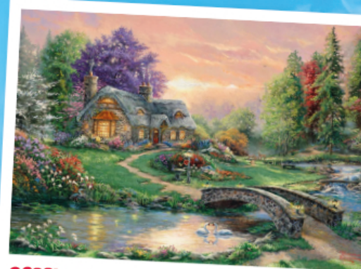
G6337 - Sweetheart Retreat by Thomas Kinkadee 1000pcs - £15.00