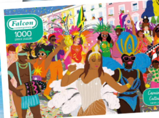
FJ11384 - Carnival Culture 500pcs - £10.00