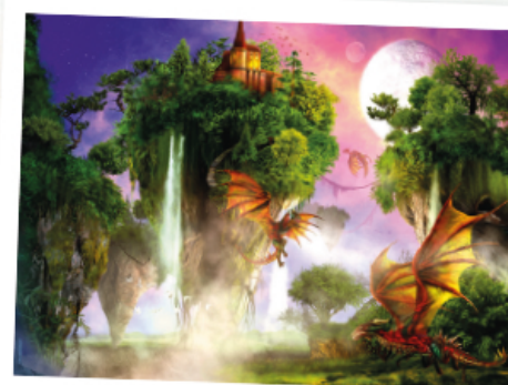
SC59912 - Custodians of the Forest 1000pcs - £14.00

Illustrated by Georgia Fellenberg this wonderful fantasy image shows dragons flying round the forest under a series of bright moons or planets, with secret paths leading up the hillside behind them up to a castle or just into the hillside itself!