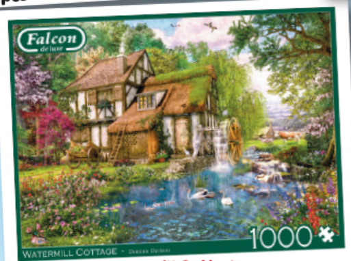
FJ11373 - Watermill Cottage 1000pcs - £14.00