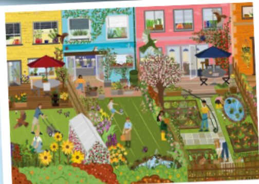
G6616 - Garden Life 1000pcs - £15.00