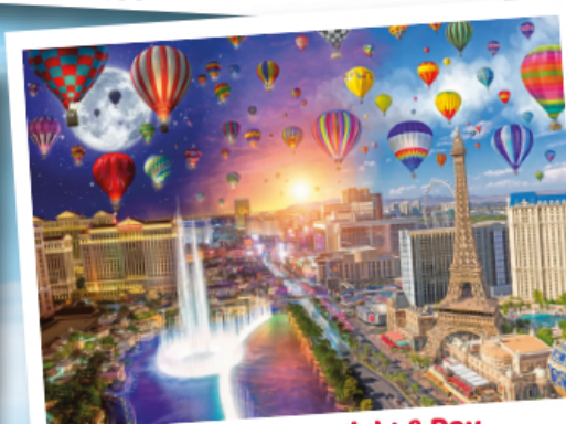
SC59907 - Las Vegas - Night & Day 1000pcs - £14.00