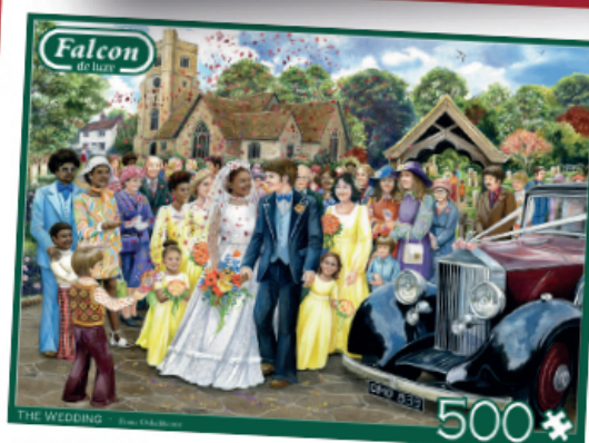
FJ11366 - The Wedding 500pcs - £10.00