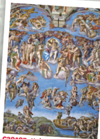
C39497 - Universal Judgement 1000pcs - £11.00