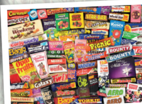
G3443 - Sweet Memories of the 1980s 500pc - £10.50