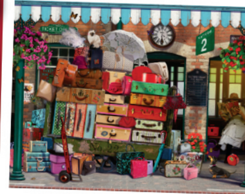
R16974 - Travelling Light 2000pcs - £20.00