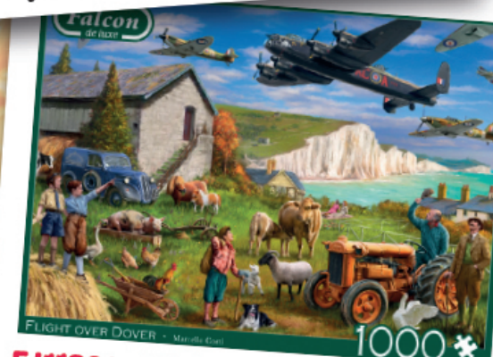
FJ11391 - Flight over Dover 1000pcs - £14.00