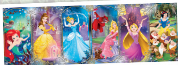
C39444 - Disney Princesses 1000pcs - £11.00

Selected SALE Puzzles (while stocks last)