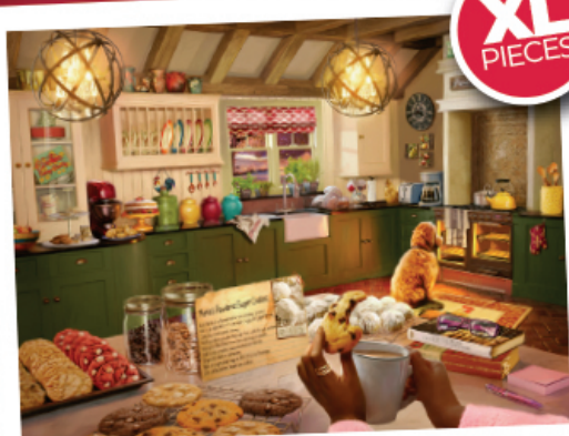
R16942 - Cozy Kitchen 750 XL pcs - £20.00