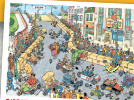
FJ20053 - Soapbox Race by Jvh 1000pcs - £14.00