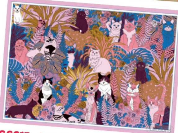
G6615 - Purrfect Plants 1000pcs - £15.00