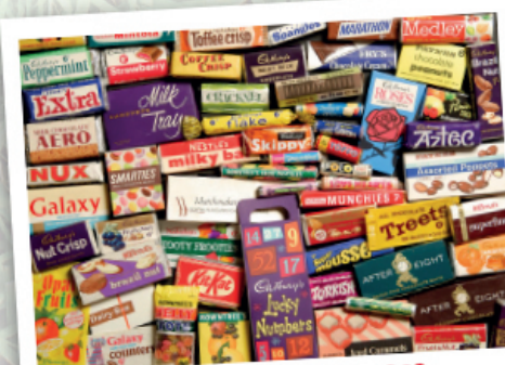
G3441 - Sweet Memories of the 1960s 500pc, £10.50

The first puzzle in the collection sees lots of sweets and chocolates that are still around today. Remember the hard fruit gums and surprise in the 5 Fry's Centre bar? Some of these sweets haven't really changed their packaging over the years but some are quite different and almost all of them will now be smaller! See how many changes you can spot between the different puzzles.