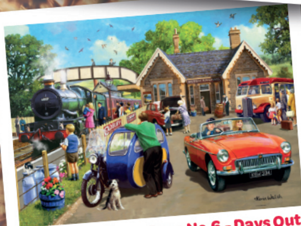
R16957 - Leisure Days No.6 - Days Out 1000pcs - £12.00