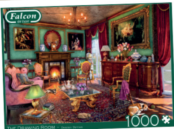
FJ11365 - The Drawing Room 1000pcs - £14.00