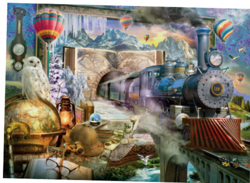
SC58964 - The Magical Journey 1000pcs - £12.00