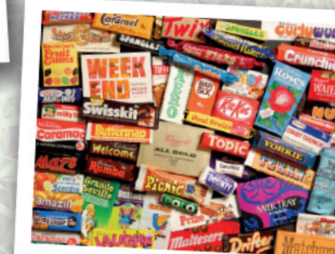
G3442 - Sweet Memories of the 1970s 500pc, £10.50