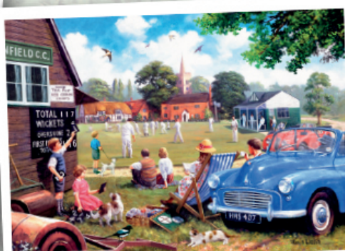
R16485 Leisure Days No 4 The Scoreboard End, 1000pc 1000pcs - £11.00