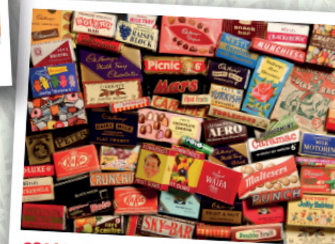
G3440 - Sweet Memories of the 1950s 500pc £10.50

This 1,000-piece puzzle features snapshots of iconic Pixar characters from beloved movies such as Toy Story, Wall E, Up, Monsters Inc and Finding Nemo. How many characters and films can you identify? Perfect for Disney fans and great fun to complete as a family.