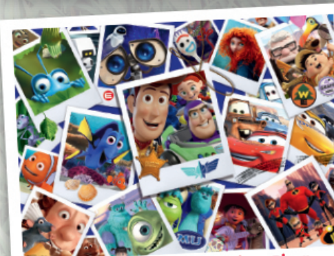
FJ19489 - Disney Pixar Collection - Pixar 1000pcs - £14.00

The first puzzle in the collection sees lots of sweets and chocolates that are still around today. Remember the hard fruit gums and surprise in the 5 Fry's Centre bar? Some of these sweets haven't really changed their packaging over the years but some are quite different and almost all of them will now be smaller! See how many changes you can spot between the different puzzles.