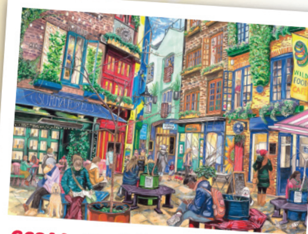
G6344 - Neal's Yard 1000pcs - £15.00