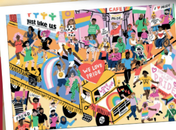
G7120 - Just Like Us 1000pcs - £15.00