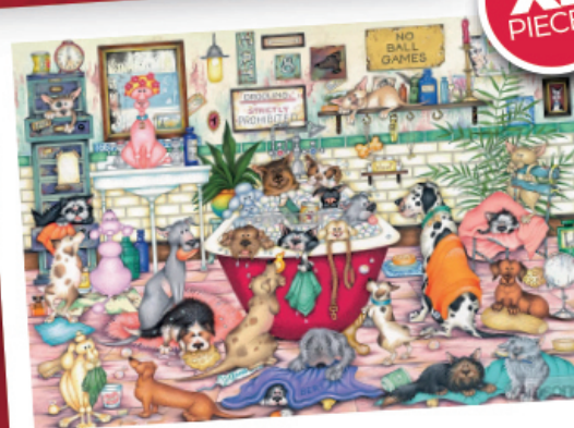
G3553 - Bert's Bath Night 500 XL pcs - £15.00