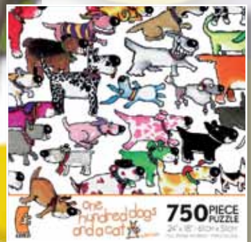
CS2976 101 Dogs & a Cat - 750pc