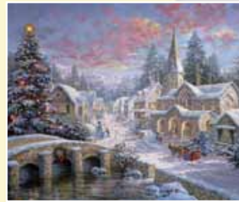
CT0017 Heaven on Earth 1000pc Limited Edition Jigsaw @ £10.00