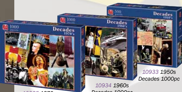
10935 1970s Decades 1000pc

All three Decades puzzles are available in 500 pc. Quote ref: 10936, 10937 or 10938 for 500 versions