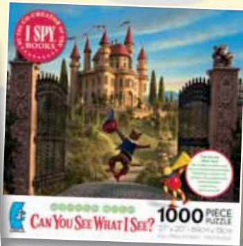
3327-7 Puss In Boots - 1000pc