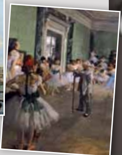
15462 Ballet School 1000pc