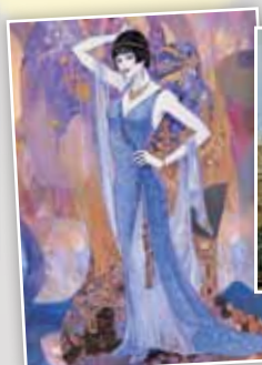
15193 Art Deco 1000pc

Three Fine Art jigsaws from Ravenburger Autumn Collection @ £10.00