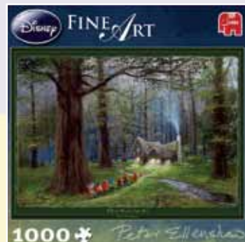
13039 Off to home we Go - 1000pc Disney Fine Art from Falcon