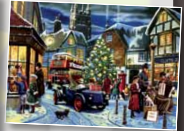
FJ10964 Christmas Shopping 1000pc Jigsaw @ £10.00