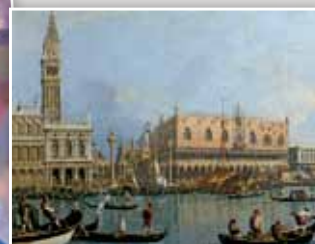
15402 Venice 1000pc