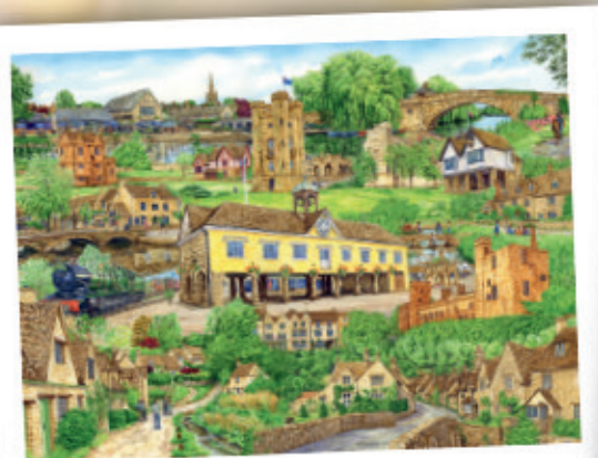
R16934 - Escape to the Cotswolds 500pcs - £10.00