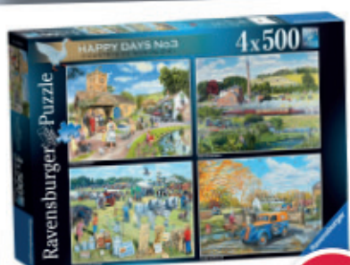
R16578 Happy Days No 3 Countryside Nostalgia 4 x 500pcs - £20.00