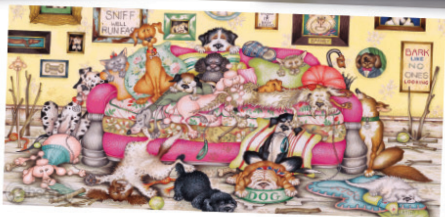
G4053 - After Walkies 636pcs - £12.00