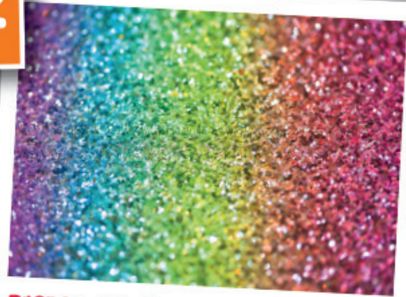
R16745 - Challenge - Glitter 1000pcs - £14.00