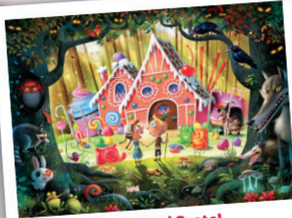
R16950 - Hansel and Gretel 1000pcs - £14.00