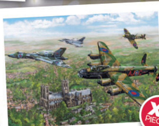
G3552 - Changing of the Guard 500 XL pcs - £15.00