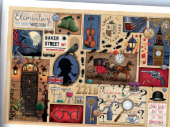
G7112 - Book Club: Sherlock Holmes 1000pcs - £15.00