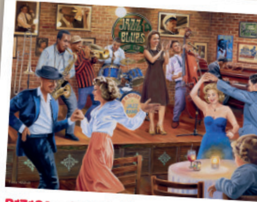
R17124 - Jumpin Jive! 500pcs - £10.00