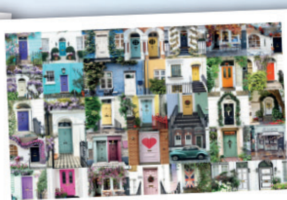
G6613 - The Doors of London 1000pcs - £15.00