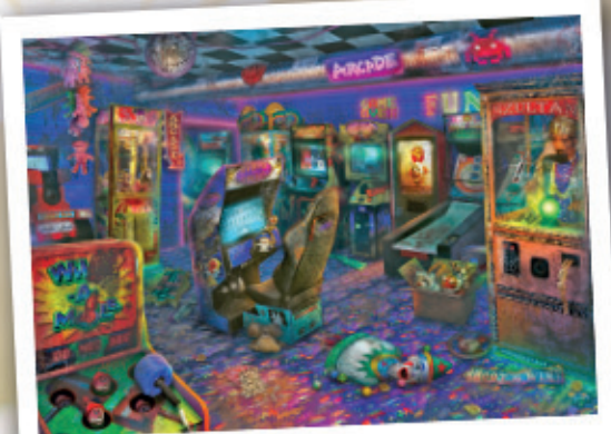
R16971 - Forgotten Arcade 1000pcs - £14.00

Matt Sewell's wonderful illustration captures not only each creature's plumage, coat or prickles, but also their different personalities. There are 25 visitors to discover and enjoy, how many can you spot in your garden or local area? Some of the more exotic creatures will only be found in the countryside, or in our capital city! Supplied with a key, identifying each creature, plus additional puzzle picture for reference.