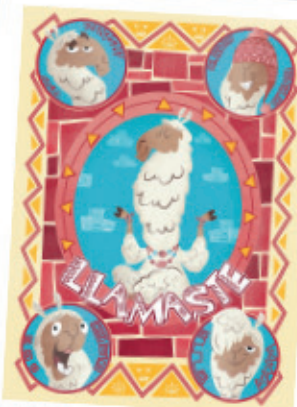
C35069 Fantastic Animals Llama 500pcs - £8.00