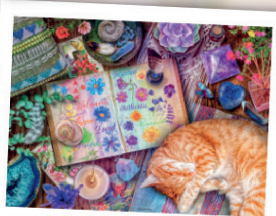
R16914 - Purrfect Peace 500pcs - £10.00