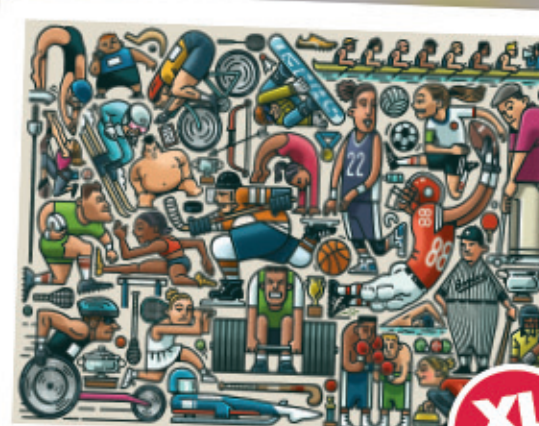
R16940 - Athletic Fit 750 XL pcs - £17.00