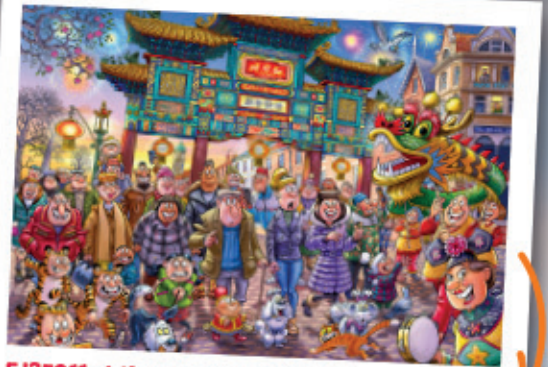
FJ25011 - WASGIJ Original 39 - Chinese New Year 1000pcs - £14.00

'Chinese New Year' sees puzzlers transported to a street being lit up by vibrant Chinese New Year celebrations. Crowds are gathering to welcome the Year of the Tiger and enjoy the fun and fireworks, but what could possibly stop the fearsome tiger-themed parade in its tracks? The WASGIJ Original concept means you need to use your imagination and clues provided to piece together - not what you see on the box, but what the people on the box see! What has the woman with the smartphone seen that could've caused her jaw to drop?