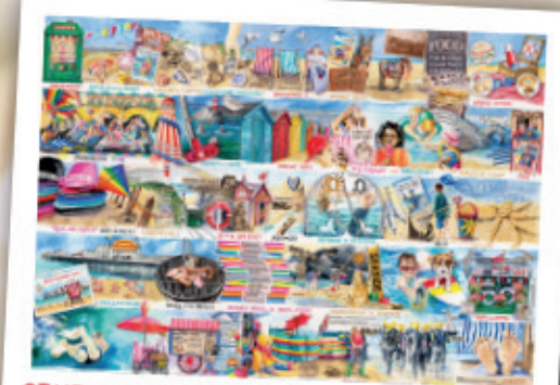
G7117 - Deckchairs & Donkeys 1000pcs - £15.00

From rainbow-coloured beach huts to fairground rides and sugary sticks of rock, this wonderful 1000 piece puzzle by Val Goldfinch captures the excitement of the Great British seaside! Each separate section of the puzzle has an amusing subject beginning with a different letter from Amusements through to SnooZZing.