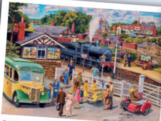
G6341 - Treats at the Station 1000pcs - £15.00