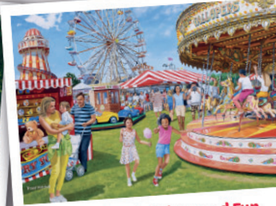
R16977 - Vintage Fairground Fun 1000pcs - £14.00