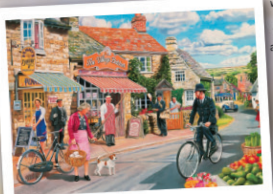
G6332 - Last Collection 1000pcs - £15.00

PC Smith is cycling through the village on his morning patrol. The smell of fresh bread sweeps down the road whilst the villagers are busy shopping for their daily essentials. The Postman is just finishing his round before he takes a well-deserved break with a cup of tea and a bun from the local Bakery! A nostalgic puzzle from the talented Trevor Mitchell.