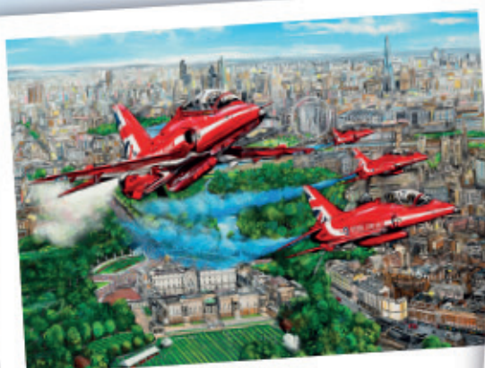
G6335 - Reds over London 1000pcs - £15.00