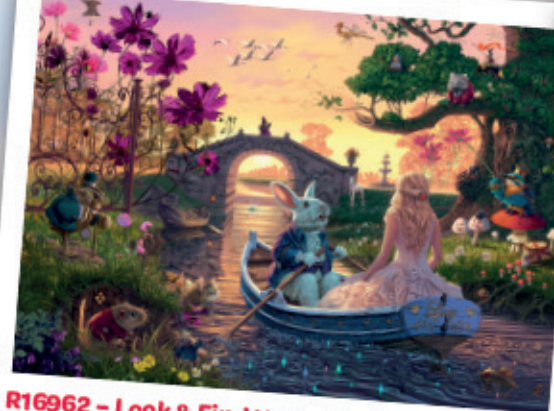
R16962 - Look & Find No.1 - Enchanted Lands 1000pcs - £14.00