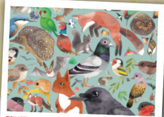
R17137 - Garden Visitors 500pcs - £10.00

Imagine discovering this forgotten arcade and wandering around ... do you remember playing these games or trying to win a toy? It looks like someone left the arcade in a hurry, dropping their popcorn as they fled. The arcade "characters" seem to watch your every move; have they been waiting for you to arrive? What if this quiet, still world were to suddenly burst into life? Which way would you run? Colourful, detailed and oh-so spooky, this puzzle will get your imagination working overtime as you sort, select and assemble the pieces.