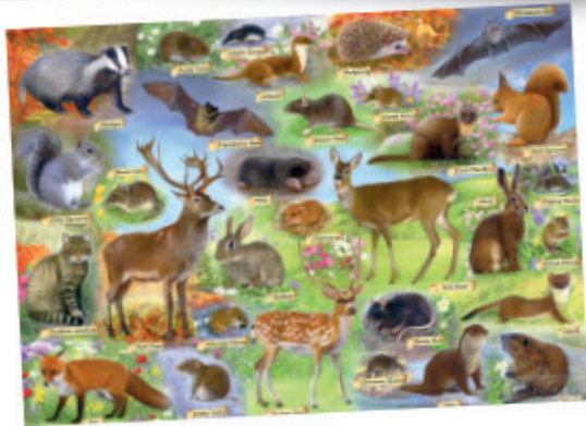
G3142 - British Wildlife 500pcs - £10.50