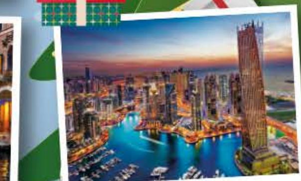
C31814 - Dubai Marina 1500pc £17