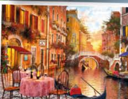
C31668 - Venice Grand Canal (Pano) 1500pc £17