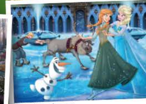
R16488 - Frozen 1000pc £13