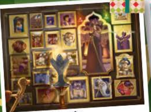
R15023 Villainous - Jafar 1000pc £13