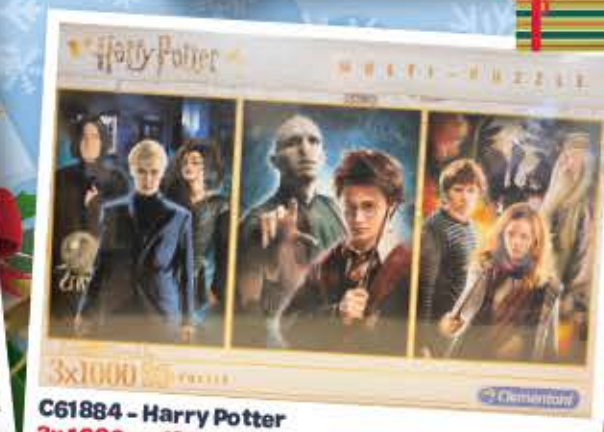
C61884 - Harry Potter 3x 1000pc £30