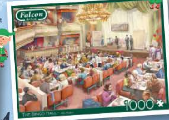
FJ11316 - The Bingo Hall - 1000pc £13

Country Conservatory is a beautiful and traditional 1000 piece puzzle, featuring cute pets and amazing wildlife illustrated by Debbie Cook. Join these cute animals in this amazing country conservatory that is bursting with flowers and plants. This looks like the perfect place to relax and enjoy a spot of tea and cake after a day well spent in the garden, surrounded by the cutest of pets and friendly chickens.