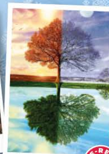
SC58223 - Season's Tree 500pc £10