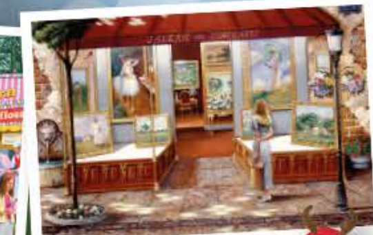
R16466 - Gallery of Fine Arts 3000pc £30