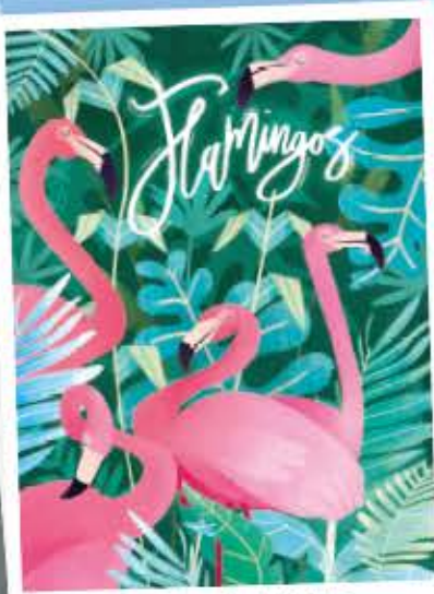
C35067 - Fantastic Animals Flamingo 500pc £10