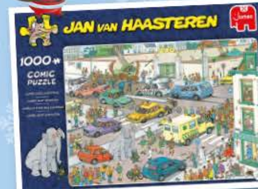
FJ20028 - JvH - Jumbo Goes Shopping 1000pc £13.50

Jumbo the elephant has decided to go shopping, he needs to get a few things on his shopping list, so naturally they have headed to the local supermarket. However, elephants and supermarkets don't mix very well and poor old Jumbo has left a trail of destruction in his path... accidentally of course! Cars have collided, passers-by are in shock and there's a large Elephant shaped hole in the wall! This very funny Jan van Haasteren zoo themed jigsaw puzzle is perfect for a peaceful puzzling session that will make you smile too!