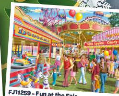
FJ11259 - Fun at the Fair 1500pc £17