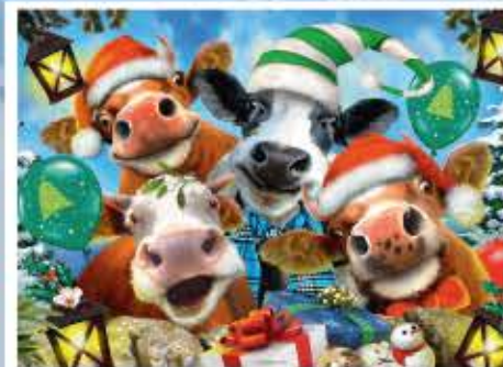
R16532 - We Wish Moo a Merry Christmas 500pc £12.00