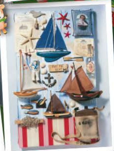
SC58381 - Maritime Potpourri 1000pc £13