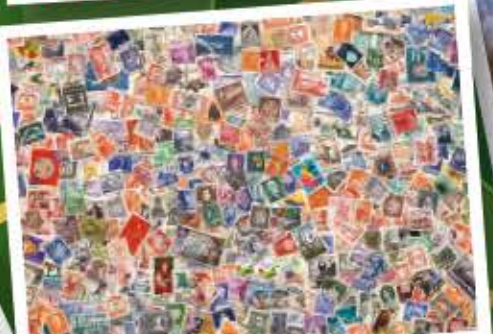
C39387 - Stamps 1000pc £13