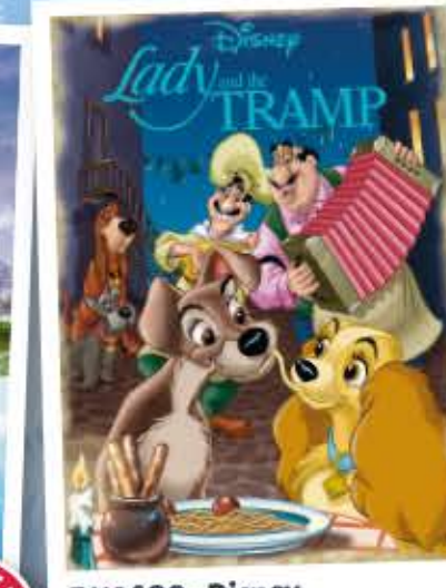
FJ19486 - Disney Lady & the Tramp Movie Poster 1000pc £13