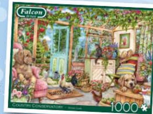
FJ11314 - Country Conservatory - 1000pc £13

Country Conservatory is a beautiful and traditional 1000 piece puzzle, featuring cute pets and amazing wildlife illustrated by Debbie Cook. Join these cute animals in this amazing country conservatory that is bursting with flowers and plants. This looks like the perfect place to relax and enjoy a spot of tea and cake after a day well spent in the garden, surrounded by the cutest of pets and friendly chickens.