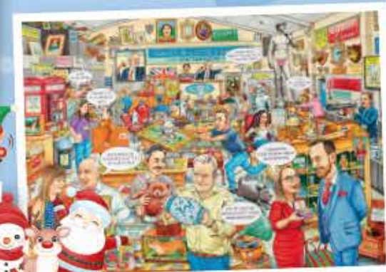
R19943 - Best of British 23 - The Auction, 1000pc £13.50

The Bingo Hall is a nostalgic 1000 piece puzzle illustrated by Alla Badsar. In this beautiful, nostalgic jigsaw puzzle, we see a hall full of bingo players. As well as enjoying an evening of entertainment, some of these players are going to enjoy being a winner! What prizes will be on offer?