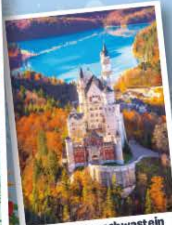
C39382 - Neuschwstein 1000pc £13