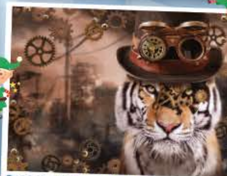
R19943 - Steampunk Tiger 1000pc £13