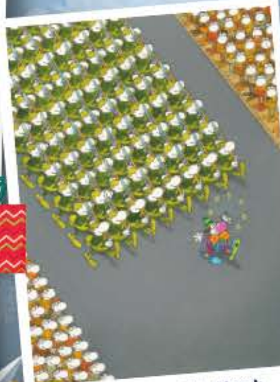
C35078 - Mordillo - The March 500pc £10