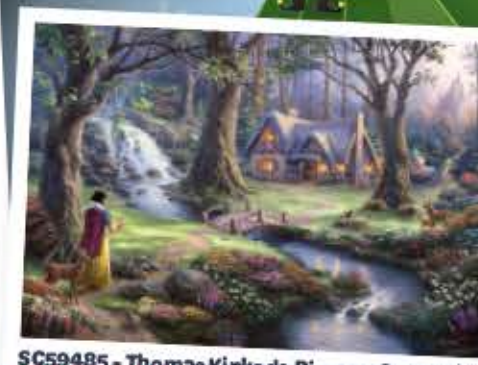
SC59485 - Thomas Kinkadee Disney - Snow White 1000pc £14