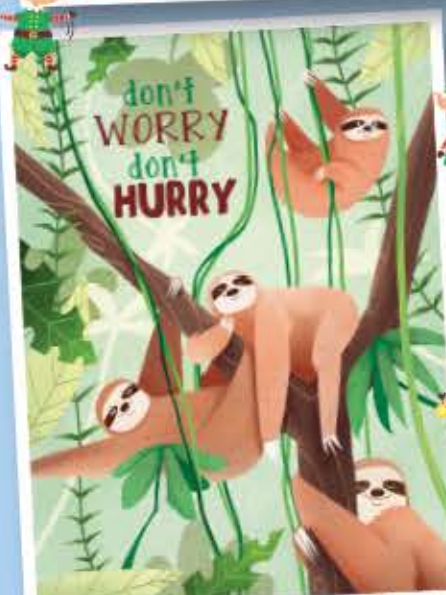
C35068 - Fantastic Animals - Sloth 500pc £10

The Auction 1000 piece puzzle is number 23 in the Best of British series from Ravensburger. Illustrated by Geoff Tristram, this image shows a busy auction scene. You'll have a lot of fun piecing this puzzle together and revealing the funny situations going on. From the woman selling her grand mother's dentures to the man who has tripped and destroyed what looks like a valuable painting!