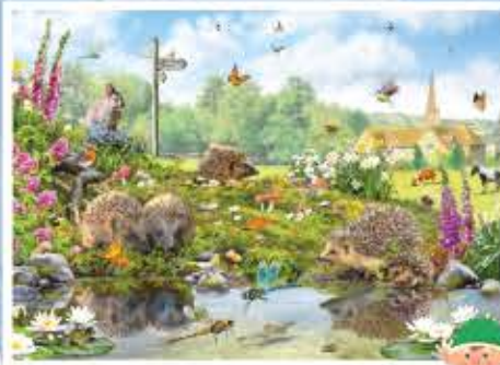
O75095 - Riverside Wildlife 1000pc £16.00