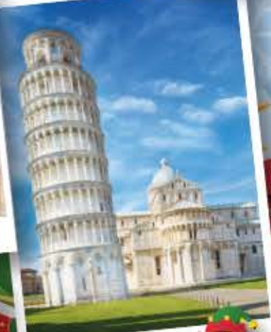
C39455 - Pisa 1000pc £13