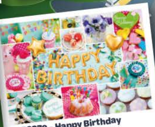
SC58379 - Happy Birthday 1000pc £13