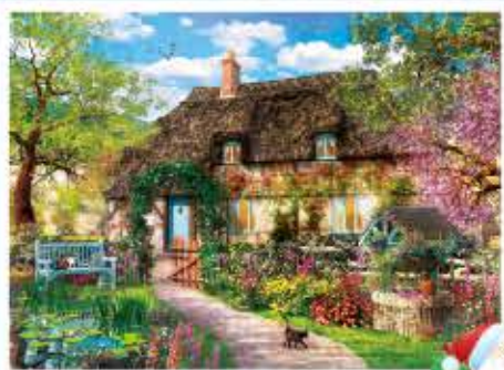
C39520 - The Old Cottage 1000pc £10.00