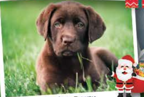
C35072 - Chocolate Puppy 500pc £10