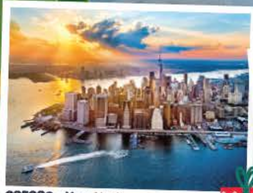
C35038 - New York 500pc £10