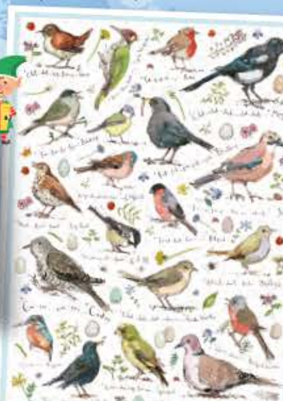
O75087 - Birdsong 1000pc £13