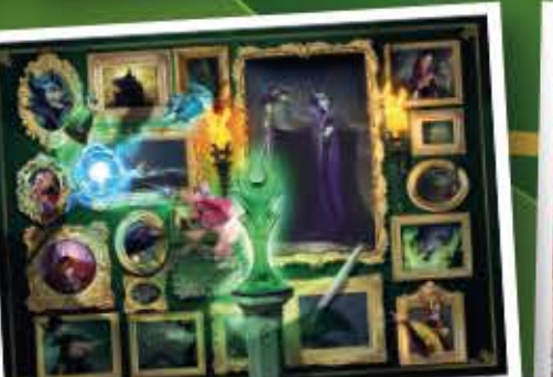
R15025 Villainous - Malificent 1000pc £13