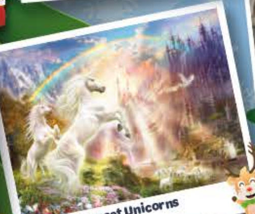
C35054 - Sunset Unicorns 500pc £10