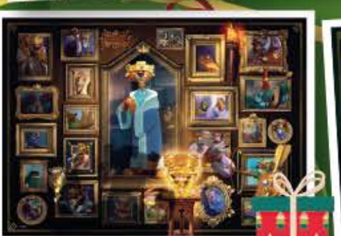
R15024 Villainous - Prince John 1000pc £13