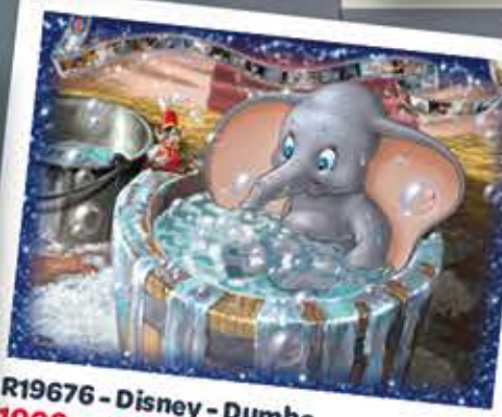
R19676 - Disney - Dumbo 1000pc £13.00