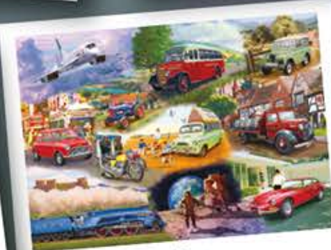
G6293 - Iconic Engines 1000pc £15.00