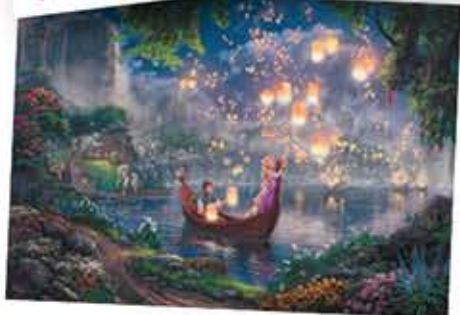
SC59480 - Thomas Kinkade Disney - Tangled 1000pc £14.00