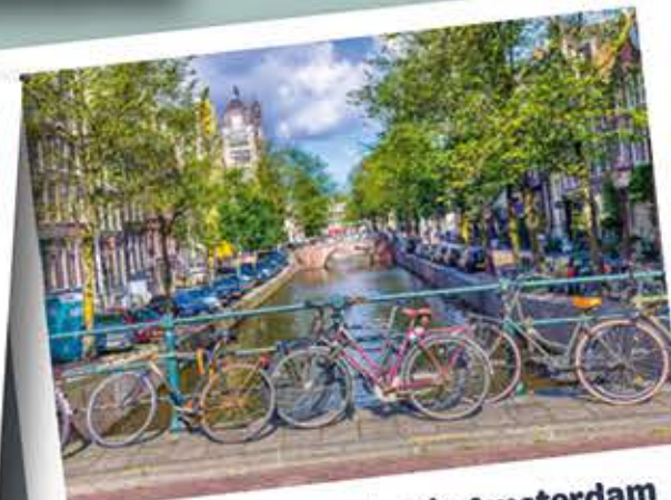
SC58942 - Springtime in Amsterdam 500pc £10.00