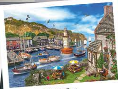
G6285 - Lighthouse Bay 1000pc £15.00