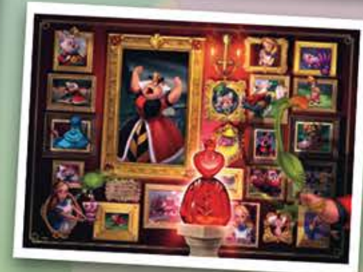
R15026 - Villainous Queen of Hearts - 1000pc £13.00

This 1000 piece puzzle is packaged in a shiny, eco-foiled gold box and inside is a special, serial-numbered certificate to make it the ultimate collector's item.