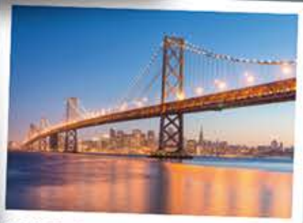
R14083 - Beautiful Skylines Golden Gate Bridge 1000pc £13.00