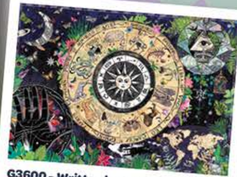
G3600 - Written in the Stars 500pc £10.00