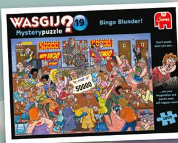
FJ19182 - WASGIJ Mystery 19 - Bingo Blunder, 1000pc £13.50

A rowdy game of bingo has come to a dramatic halt as one player is certain they have just nabbed the top prize. But is everything as it seems? Use your imagination, and the clues provided on the box, to piece together what will happen next... this is the scene you will have to puzzle.