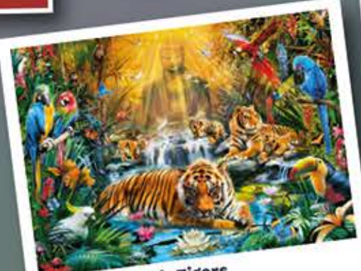
C39380 - Mystic Tigers 1000pc £13.00