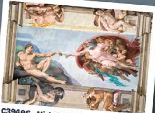
C39496 - Michelangelo - Creation of Man 1000pc £13.00