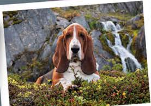
C39511 - Charlie Brown 1000pc £13.00