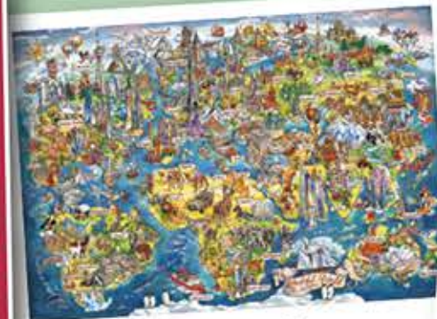
G8018 - Wonderful World 2000pc £22.00