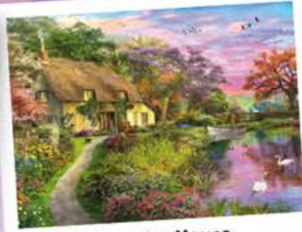
R15041 - Country House 500pc £10.00