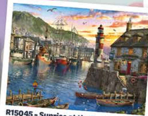
R15045 - Sunrise at the Port 500pc £10.00