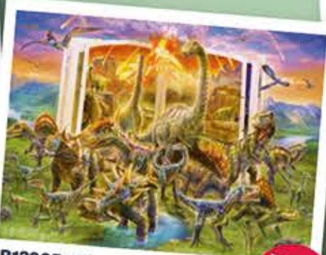
R12905 - Dino Dictionary 300pc XXL £10.00