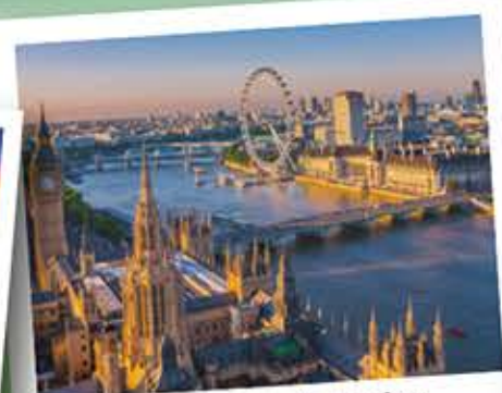
R16627 - Atmospheric London 2000pc £22.00