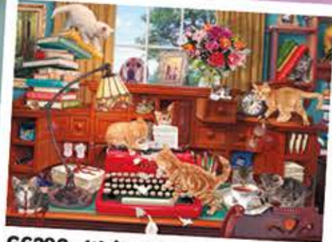
G6290 - Writer's Block 1000pc £13.00