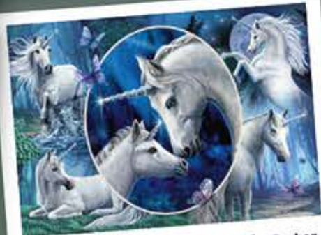
SC59668 - Mythical Unicorns by Lisa Parker 1000pc £13.00