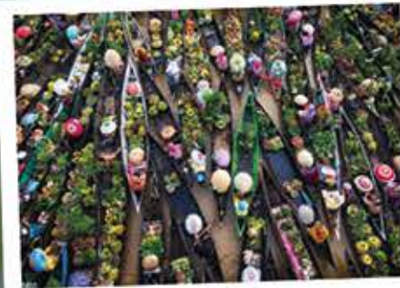
G3601 - Floating Market 500pc £10.00