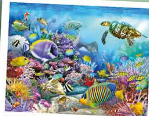
R16704 - Coral Reef Majesty 2000pc £22.00