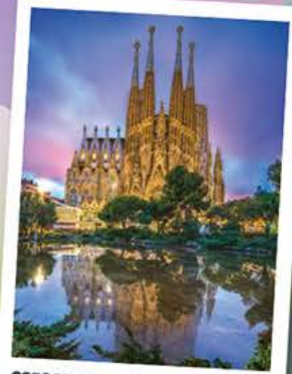
C35062 - Barcelona 500pc £10.00