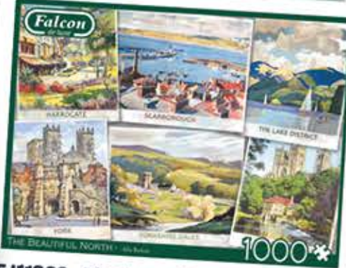
FJ11303 - The Beautiful North 1000pc £13.00