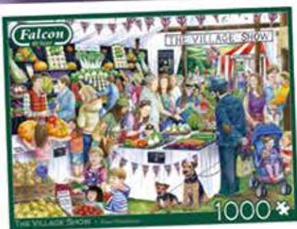
FJ11302 - The Village Show 1000pc £13.00