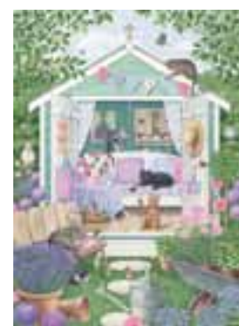
O70832 Summer Garden Cats 1000pc £ 13.00