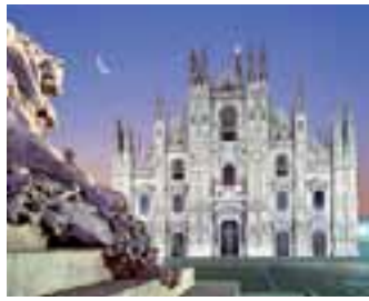
C30288 Duomo 500pc £8.50