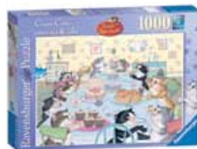
R19415 Crazy Cats Enjoy Tea & Cakes 1000pc £13.00