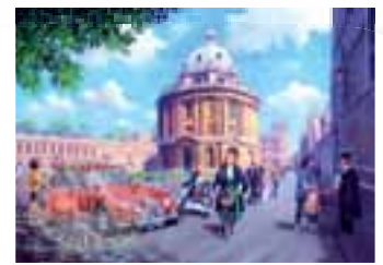
R19072 Happy Days Oxford 1000pc £13.00