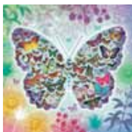
O59603 Butterfly Garden 1000pc £13.00