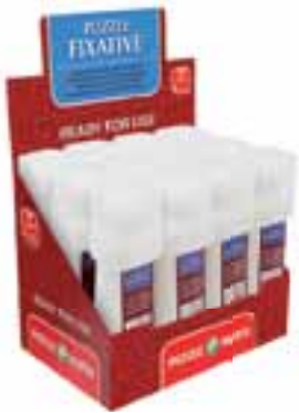
FJ17950 Puzzle Fixative £6.00