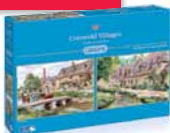
G5028 Cotswold Village 2 x 1000pc £20.00