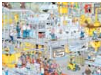
FJ17452 Chocolate Factory 1000pc £13.00