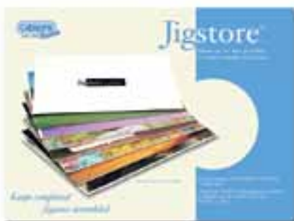
G207 Jigstore 1000 (for 10 puzzles up to 70 x 51cm) £45