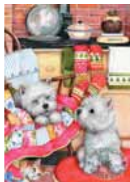
O58880 Westies by the Aga 1000pc £13.00