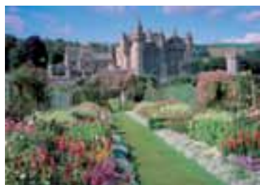
R19127 Sir Walter Scott's House 1000pc £13.00