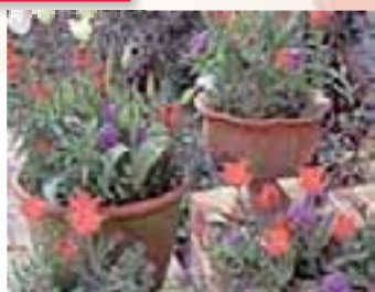
CA10829 Tulips & Pansies in Pots 1000pc £14.00