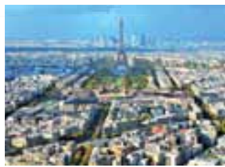
R19302 Above the Rooftops of Paris 1000pc £13.00