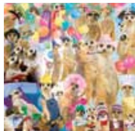
O58586-2 Meerkat Madness 1000pc £13.00