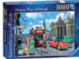
R19414 Happy Days Edinburgh 1000pc £13.00