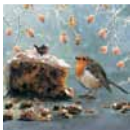
O57422 Christmas Robin - 1000pc £13.00