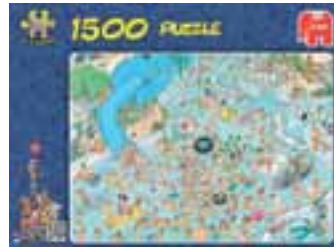
FJ19314 / FJ19315 Wacky Water World 1500pc / 3000pc £15 / £25