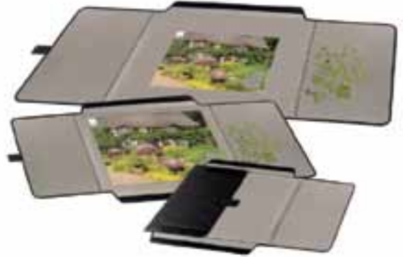
FJ10715 / FJ10806 Portapuzzle Standard 1000pc / 2000pc £25 / £30