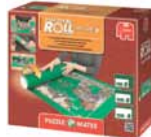
FJ17690 / FJ17691 Puzzle & Roll (includes random 1000 pc puzzle) 1500pc / 3000pc £20 / £25