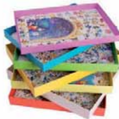
G201 Jigsaw (for up to 1000 pc puzzles) £25.00