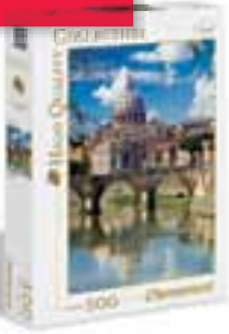
C30344 Roma 500pc £8.50