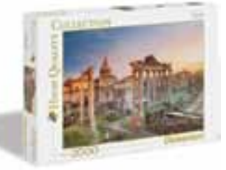
C32549 Forum Romanum 2000pc £20.00