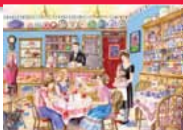
G6106 Afternoon Tea 1000pc £13.00