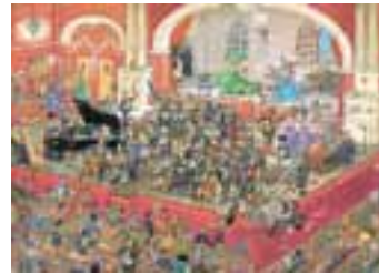
FJ17222 St George & The Dragon 2000pc £20.00