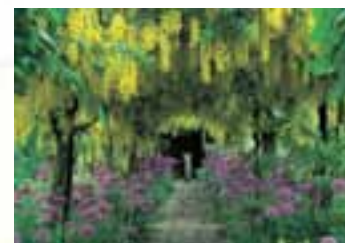
CA01350 Laburnum Arch 1000pc £14.00