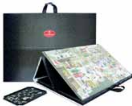
FJ17252 Portapuzzle Pro 1000pc £40.00