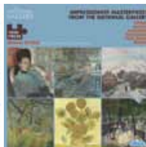
G6026 Impressionists 1000pc £13.00