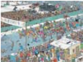
FJ17310 / FJ17311 City Ice Tour 1000pc / 2000pc £13 / £20