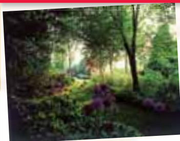
CA01543 Lady Farm 1000pc £14.00