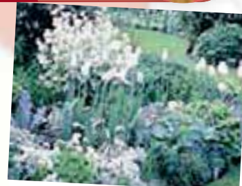
CA10843 Tulips at Chenies 1000pc £14.00