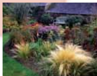
CA01542 Pettifers Garden 1000pc £14.00