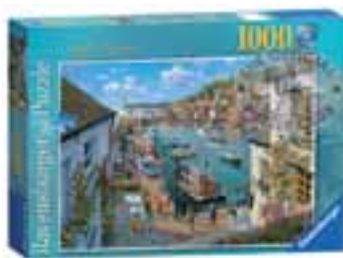
R19158 Safe Haven 1000pc £13.00