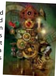
SC59273 Time's Running -1000pc £13.00