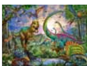
R12718 Realm of the Giants 200XXL £8.50