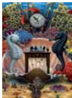
SC59513 Playing Chess in the Sea Jacek Yerka - 1000PC £13.00