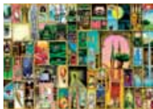
SC59401 Insights - Colin Thompson - 1000PC £13.00