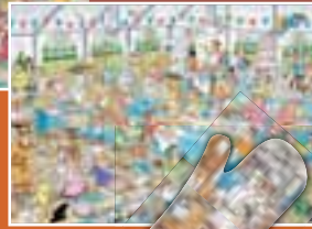
FJ19003 Food Frenzy 2x1000pc £20.00