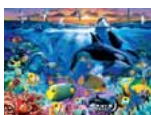
R12663 Oceanic Life 200XXL £8.50