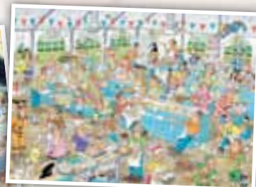
FJ19003 Food Frenzy 2x1000 £20.00