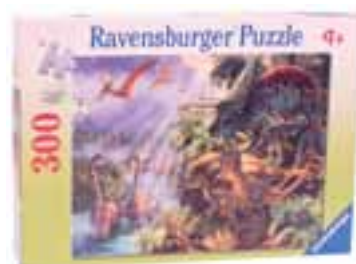
R13044 Extinct Giants 300XXL £8.50