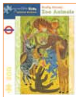
JK026 Zoo Animals 300XL £8.50