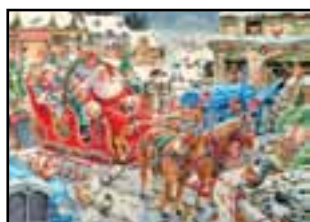
R19452 Christmas Farm Limited Edition - 1000PC £14.00