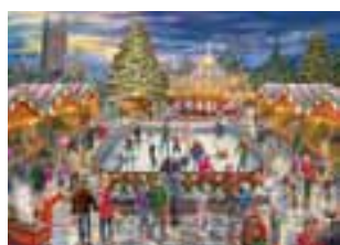
G2014 Christmas Market Limited Edition - 1000PC £14.00