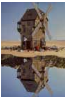
SC59510 Reflections 500pc £9.00