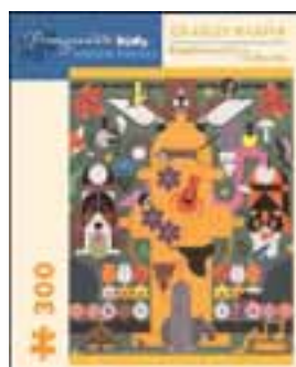
JK006 Biodiversity - Charles Harper 300XL £8.50