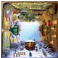
SC59279 The Four Seasons Garden - Jacek Yerka 1000PC £13.00