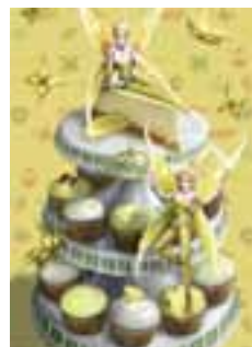
SC57363 Lemon Elves 500PC £9.00