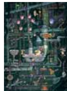
SC58190 Gumpert's Swarming Machine - 1500PC £17.00