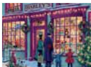
FJ11056 The Toy Shop 1000PC £14.00