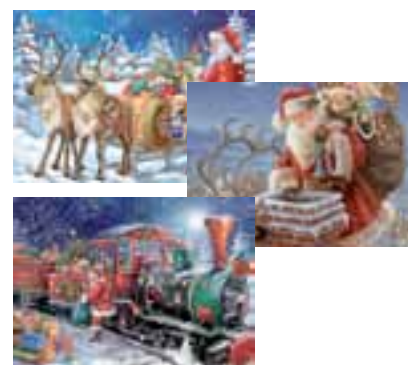
FJ11069 Christmas Collection - Volume 2 - 3x1000PC £25.00