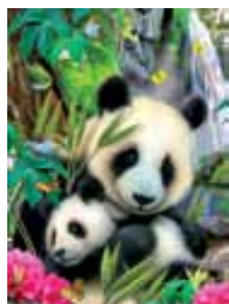
R13065 Panda 300XXL £8.50