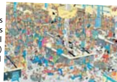
FJ17467 All Queued Up! - 2000pc £20.00

All Queued Up – captures all the "wacky" possibilities that could (all you will have probably witnessed) happen in a jam-packed supermarket.