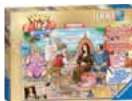
R19437 What if? No 7 The Portrait 1000pc £13.00