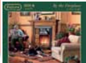
FJ11067 By the Fireplace 1000pc £13.00