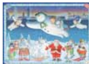
R19346 Snowman & Snowdog 1000pc £11.00