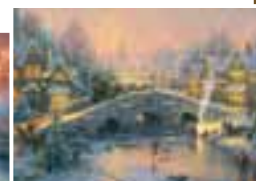
G5029 Nannette's Cottage and Spirit of Christmas -Thomas Kinkadee 2 x 500pc £12.00