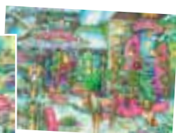
FJ10091 Christmas Wishes 2 x 1000 £15.00