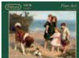
FJ11066 Summer Fun 500pc £8.50