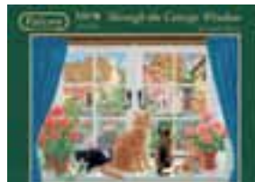
FJ11064 Through the Cottage Window 500pc £8.50