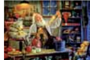
G3070 Magical Paint 500 £9.00