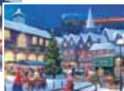
G5014 Christmas Eve 2 x 500pc £12.00