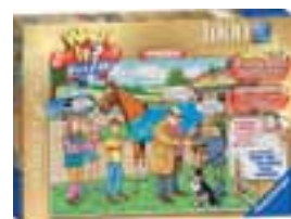
R19438 What if? No 8 The Racehorse 1000pc £13.00