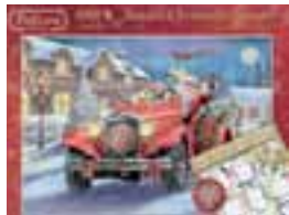
FJ11068 Santa's Christmas Present (free 500 pc Calendar puzzle) 1000 £13.00