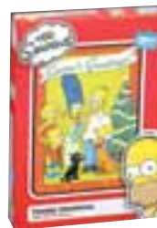
PLG7050 Simpson's Family Christmas 500pc £7.00