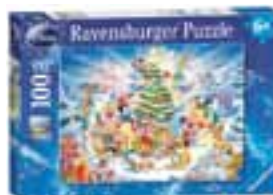
R10545 Disney Christmas Eve - XXL 100 £8.00