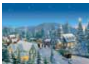
G6133 Holiday Traditions - Thomas Kinkadee 1000pc £12.00