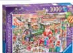
R19345 The Santa Express - 2013 Limited Edition 1000pc £11.00