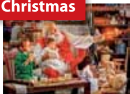
G6146 Calling the Sleigh 1000pc (also available in 2000pc G8006) £14.00 / £22.00