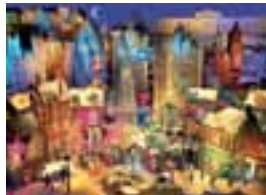
G7044 Santa's Midnight Magic 1000 £14.00