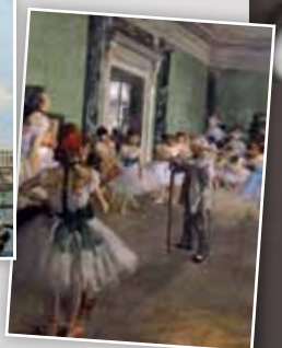
15462 Ballet School 1000pc