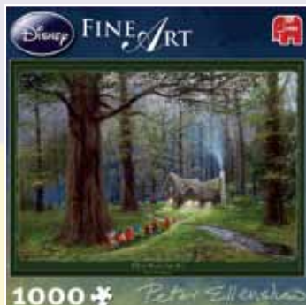
13039 Off to home we Go - 1000pc Disney Fine Art from Falcon