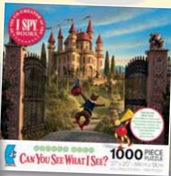
3327-7 Puss In Boots - 1000pc