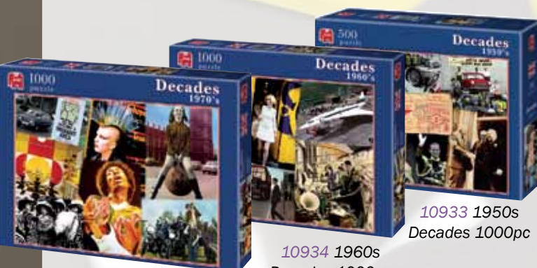
10935 1970s Decades 1000pc

Quote ref: 10936, 10937 or 10938 for 500 versions