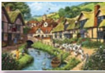
FJ10926 Country Village - 1500pc