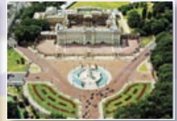
FJ10922 Buckingham Palace - 1000pc