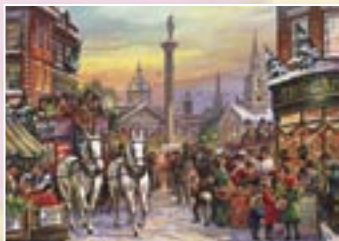
FJ10911 Christmas Carriage - 1000pc