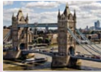
FJ10960 London Bridge - 1000pc