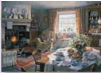
FJ10905 Afternoon Tea - 500 pc

1000pc deluxe jigsaws are £9.00 JVH & Wasgij - £10.00 1500pc deluxe jigsaws - £13.00 500pc - £7.00 / 2 x 500pc - £10.00 1000pc Shaped Jigsaws - £13.00