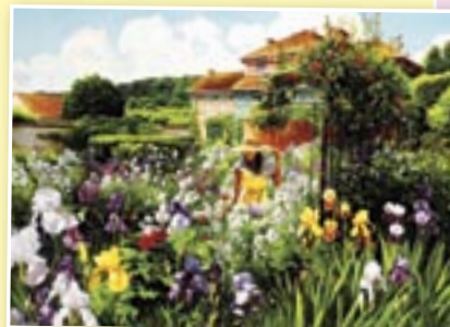
A taste of sunny summer days Floral Fantasy - from Falcon's 2009 collection-1000pc available at £9.00

To order Old Village Pub and/or Country Life and/or Floral Fantasy or any of the other products featured in this issue complete the Order form below and send with your remittance payable to: The Official UK Puzzle Club The Official UK Puzzle Club, PO Box 3351, Wokingham, Berkshire, RG41 2WE. (If you don't want to spoil your newsletter, simply put your request on paper)