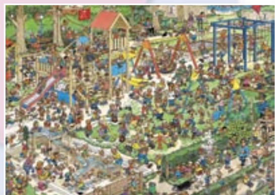
The Playground - 1000pc

Whilst every effort will be made to ensure your choice is available, deliveries are not as frequent as our UK based factories so it may take a little longer to fulfil your order.