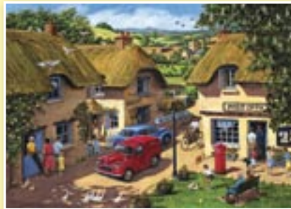
Country Life - Nostalgic image from Falcon's 2009 Collection available at £9.00