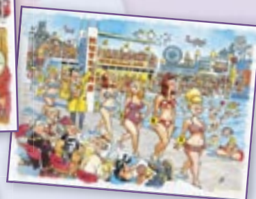
Wasgij Destiny 9 - Super Models