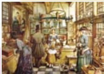
FJ13015 The Bakery - 1000pc