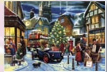
FJ10931 Christmas Shopping - 1000pc