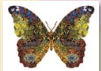
FJ01672 Shaped Butterfly - 1000pc