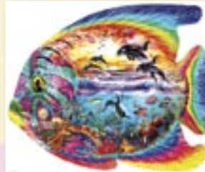
FJ01651 Shaped Ocean Fish - 1000pc