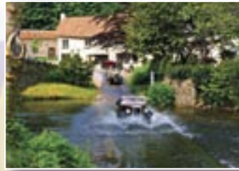
FJ10924 Ride in Country - 1000pc