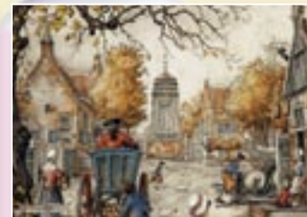
FJ13016 The Village Square - 1000pc