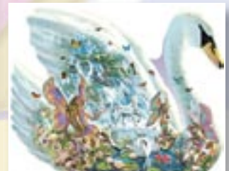
FJ01665 Shaped Angelic Swan - 1000pc