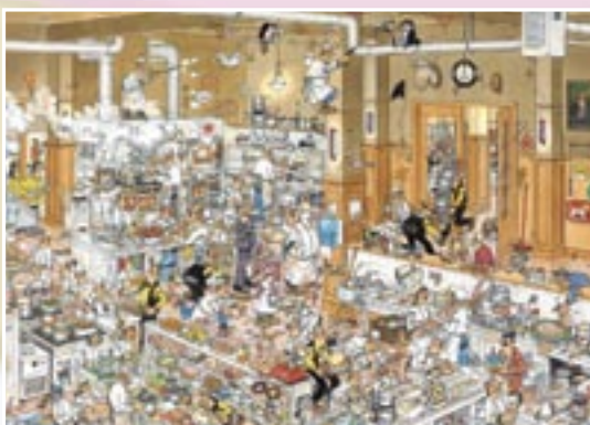
The Kitchen - 1000pc

Place on reserve to secure your copy. Delivery approx. 6 weeks