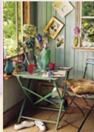
FJ01591 Woodland Lodge (no image) & Artist's Corner 2 x 500pc