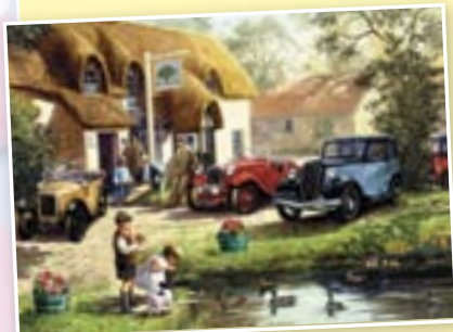
Old Village Pub - from Falcons 2009 Deluxe range -1000pc jigsaw available at £9.00