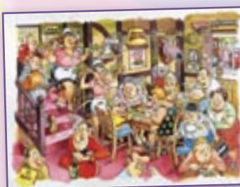
Wasgij Mystery 5 - Sunday Lunch