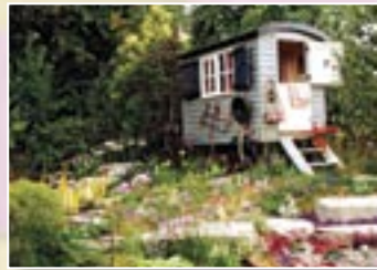
FJ01698 Garden Getaway - 1000pc