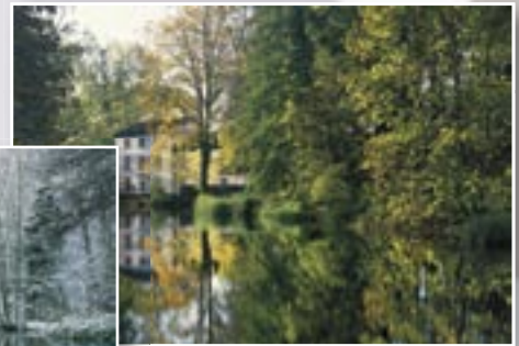
Seasonal Serenity - 2 x 500