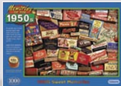
1950s Sweet Memories - 1000pc