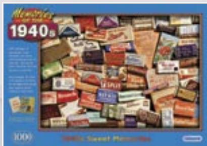
1940s Sweet Memories - 1000pc

To add to your collection of 'Shopping Baskets' - a brand new range called Sweet Memories