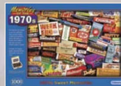
1970s Sweet Memories - 1000pc