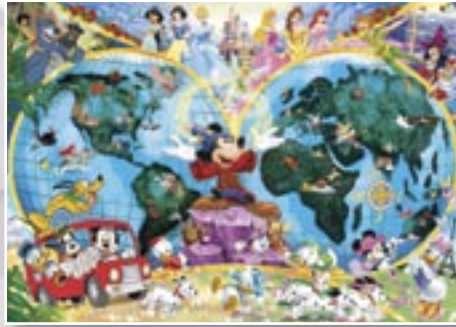
Disney World Map - 1000pc