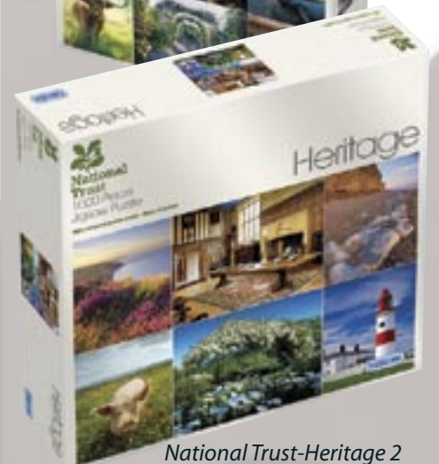
National Trust-Heritage 2 1000pc