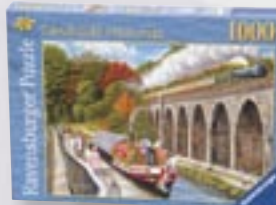
Canalside Memories - 1000pc