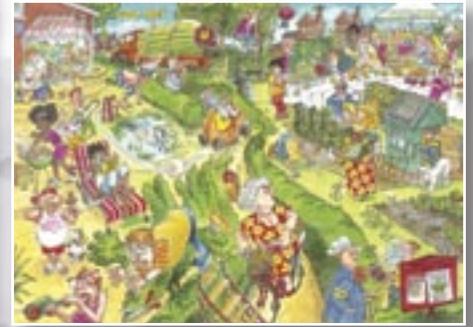
Great British Allotment - 1000pc