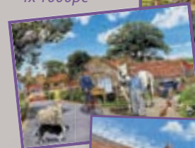
Open all Hours 2x 1000pc