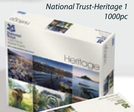
National Trust-Heritage 1 1000pc