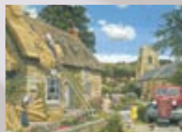
A New Thatch - 1000pc