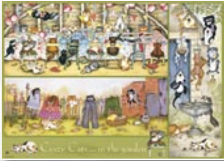
Crazy Cats in Garden - 1000pc