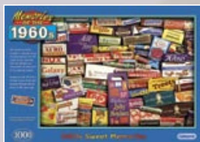
1960s Sweet Memories - 1000pc