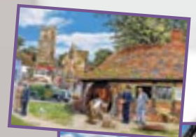
Postmans Round 4x 1000pc