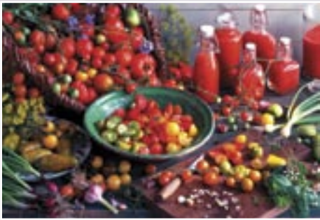
Tomatoe Potpourri - 1000pc