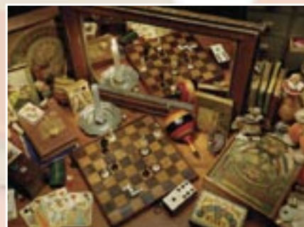
3327-3 Magic Mirror 1000pc - Walter Wick