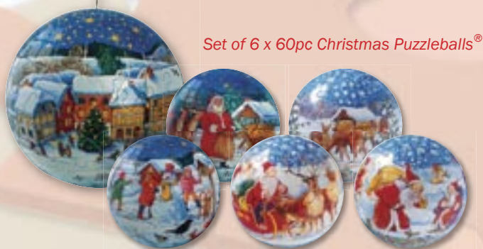
Set of 6 x 60pc Christmas Puzzleballs®