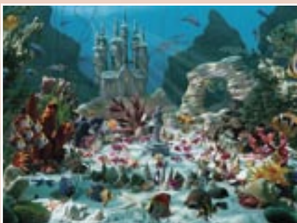
3327-2 Little Mermaid 1000pc - Walter Wick