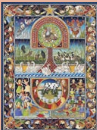
TG310 - Twelve Days of Christmas