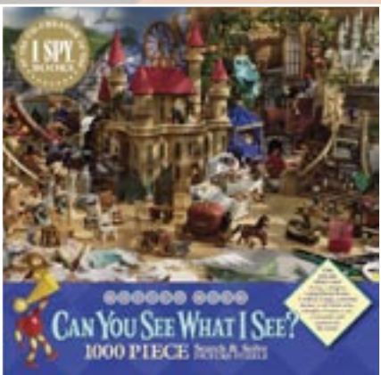
3327-1 Ever After 1000pc - Walter Wick