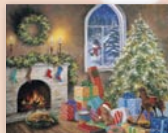
WM315- 'Twas the Night before Christmas 1000pc (76 x 61cm)