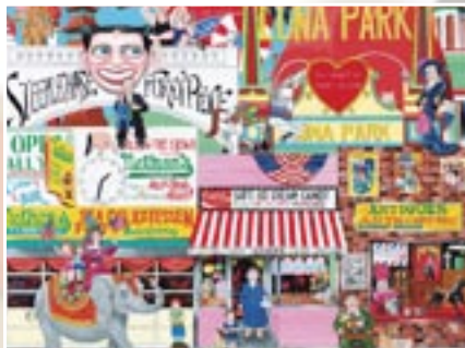
3332-3 Coney Island Melody - 1000pc Amy Nelder