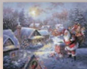
WM 337-Bringing Joy & Happiness 1000pc (76 x 61cm)