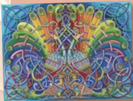
TG307 - Courting Peacocks

Courting Peacocks by Artist Rachel Arbuckle from Tailten