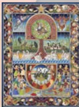
Twelve Days of Christmas-500pc/1000pc