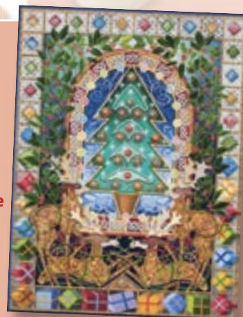
Yuletide Offerings from Tailten

Games - A 1000pc Christmas challenge available at £12.99