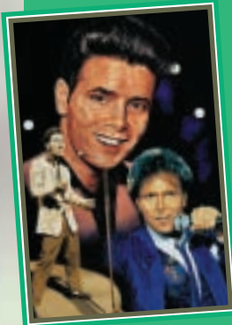
Cliff Richards - 1000 pcs

How many celebrities can boast a No.1 hit in every decade since the 1950's? Cliff Richards 'Legends'