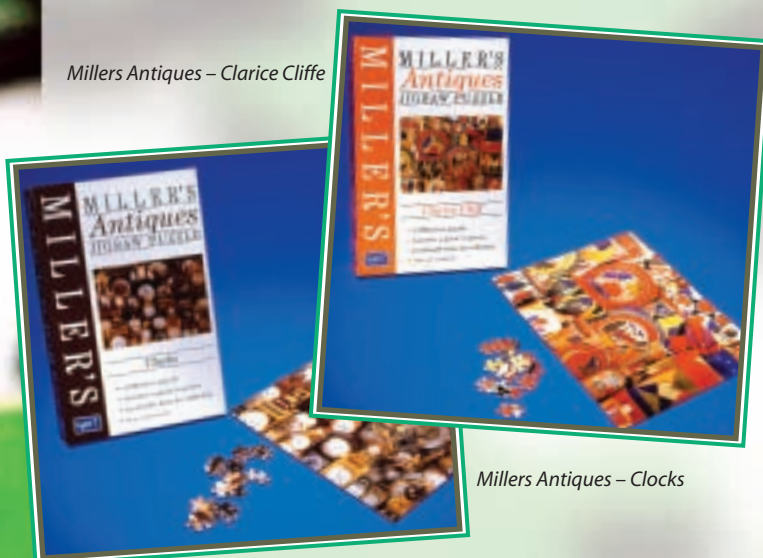
Millers Antiques – Clocks