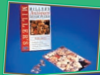
Millers Antiques – Teddy Bears

Available at £8.99 each or buy both for £13.50 + £3.50 p&p.