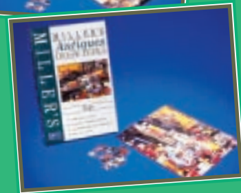
Millers Antiques – Tinplate Toys